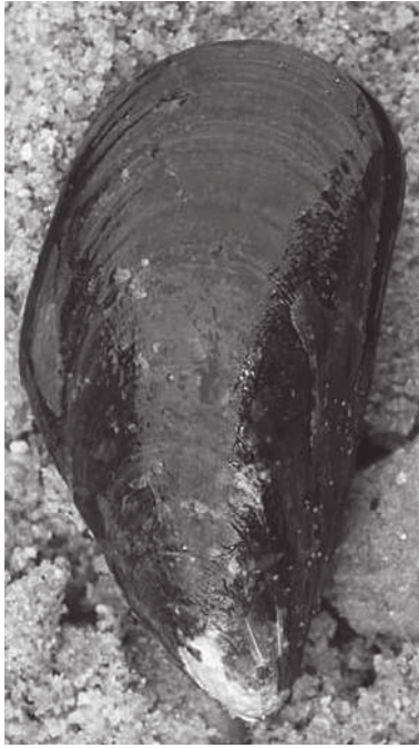
magnification \times 2 Fig. 5.1