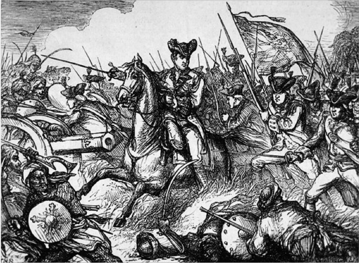
An eighteenth-century British print of the Battle of Palashi (Plassey)

During the war with France, which broke out in 1756, the British used internal divisions in Bengal to their advantage. They weakened the position of Sirajuddaula and when the disputes between the Nawab and the British led to conflict, it was the East India Company that was victorious. The decisive battle took place at Palashi in 1757. The British installed a puppet ruler in Bengal. British influence was extended by the acquisition of three districts in 1760 and by gaining the right to collect revenue. A treaty of 1765 allowed Bengal to be ruled by collaborators with the British in return for surplus revenues, but the rule of the Company did little for the people of Bengal. There was considerable hardship in the Great Famine of 1769–1770 and as a result of reforms to Company rule, such as the Permanent Settlement of 1793.