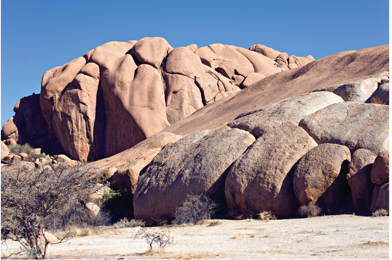
A landform in a tropical environment