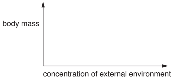
Fig. 3.2 [1]

(iii) On Fig. 3.2, sketch a line to show how the body mass of a mussel would change as the concentration of the external environment changes.