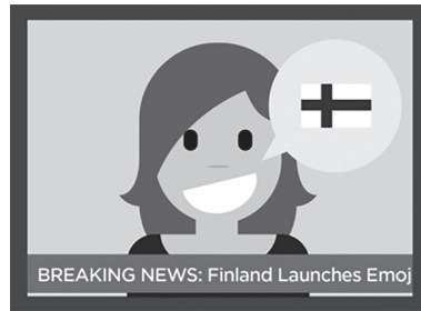
Fig. 1.1 for Question 1

Finland recently made headlines with its release of 30 country-branding emojis, in a unique twist on regular promotion efforts. An emoji is a small digital image or icon used to express an idea or emotion in electronic communication. Said to reflect aspects of the Finnish national character, the list of country-brand emojis includes a sauna emoji and a woolly sock emoji.