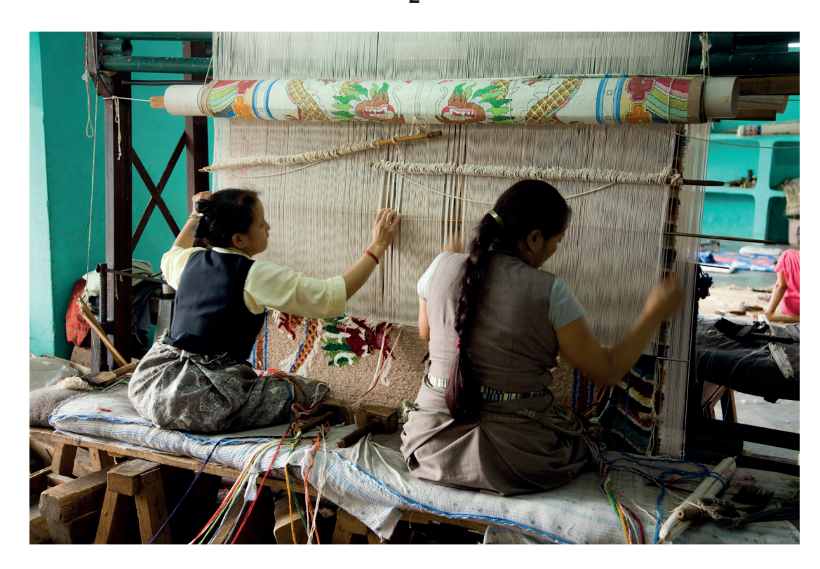
Photograph A for Question 3(a).