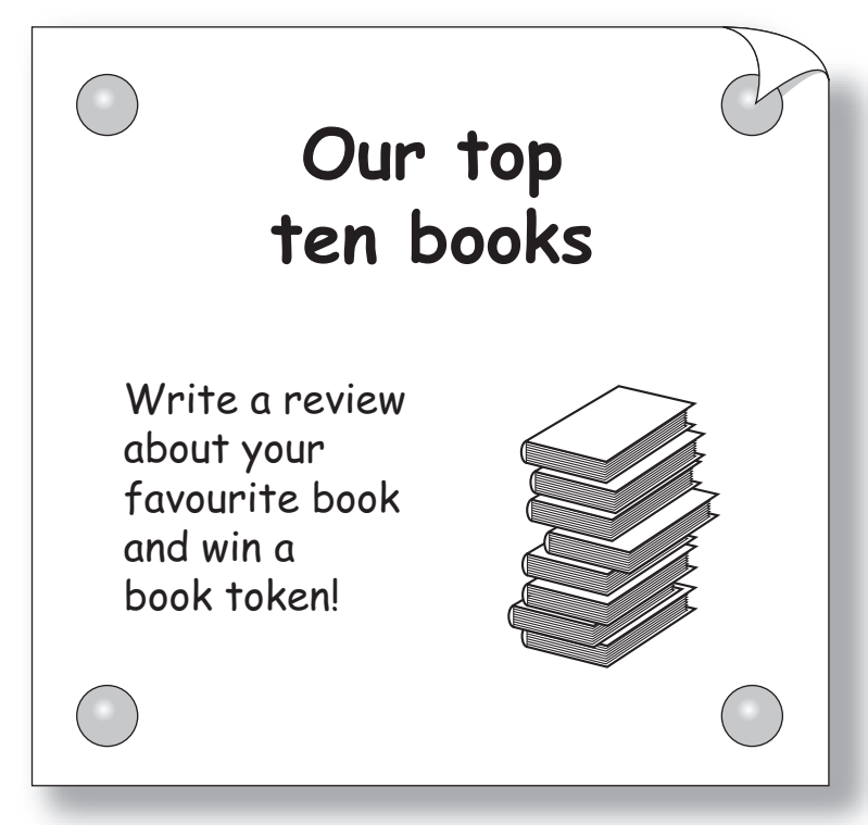
Part 3: Exercise 1

Your school magazine is compiling a list of popular books.