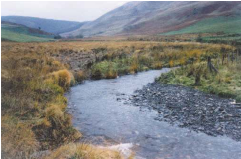
Photograph A for Question 2