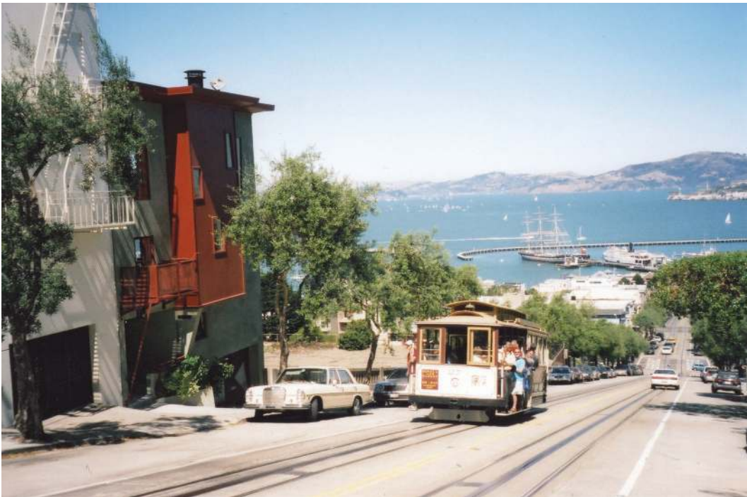
Photograph C for Question 3 is on page 4