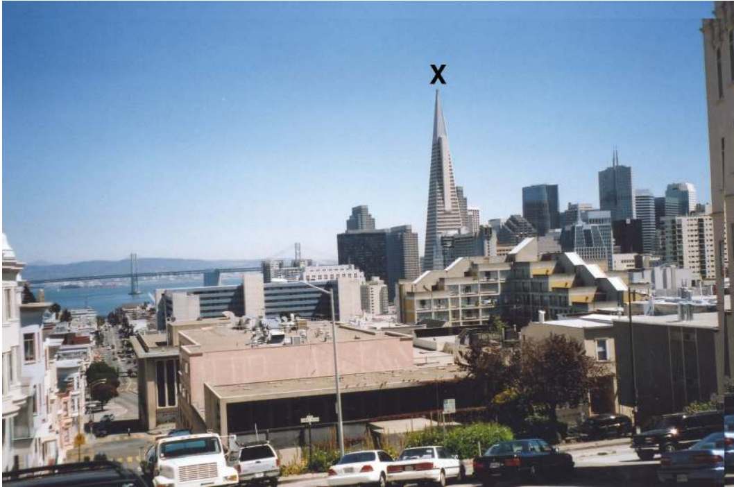
Photograph C for Question 3