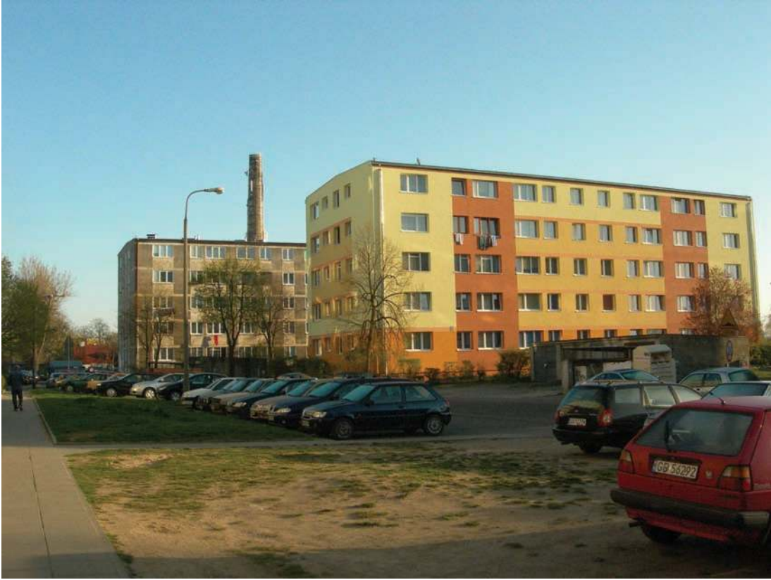
Photograph B showing area B for Question 2