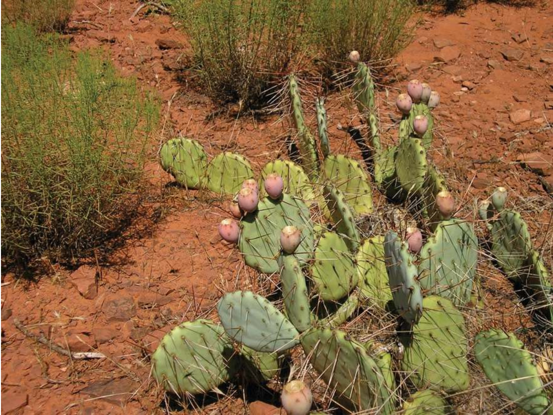
Photograph C for Question 6