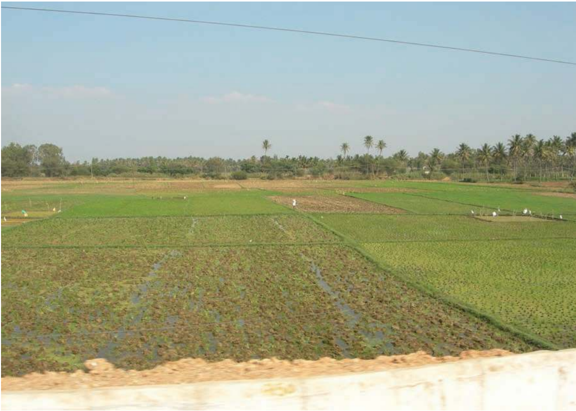
Photograph E for Question 6