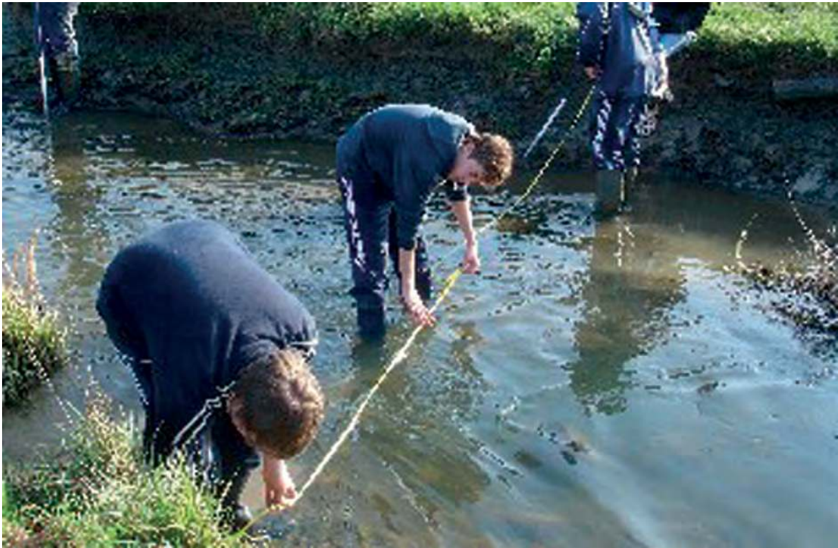
Photograph B for Question 1