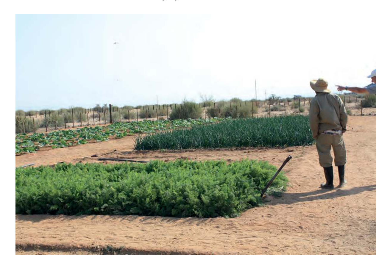
Photograph D for Question 5