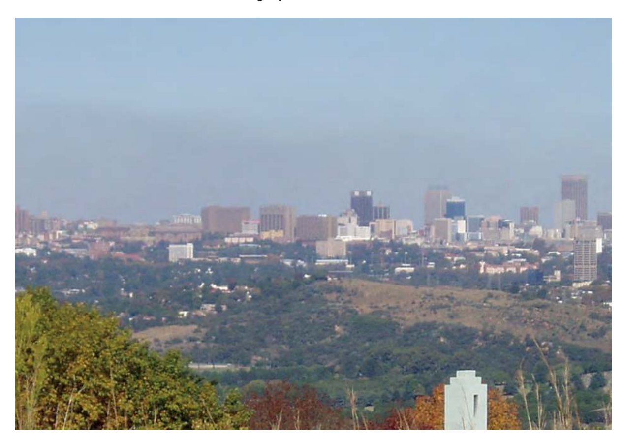
Photograph D for Question 5