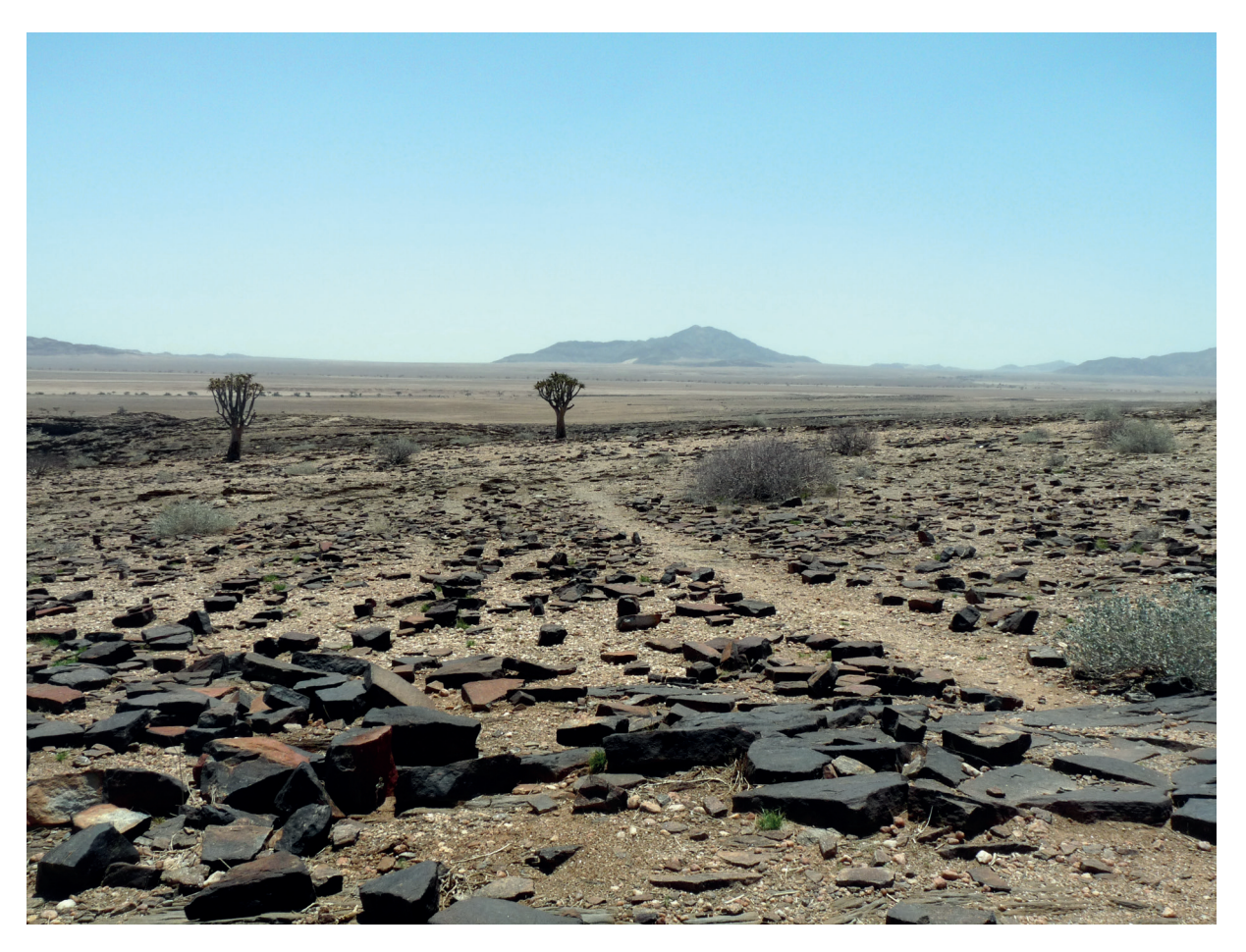
Fig. 4.1 for Question 4