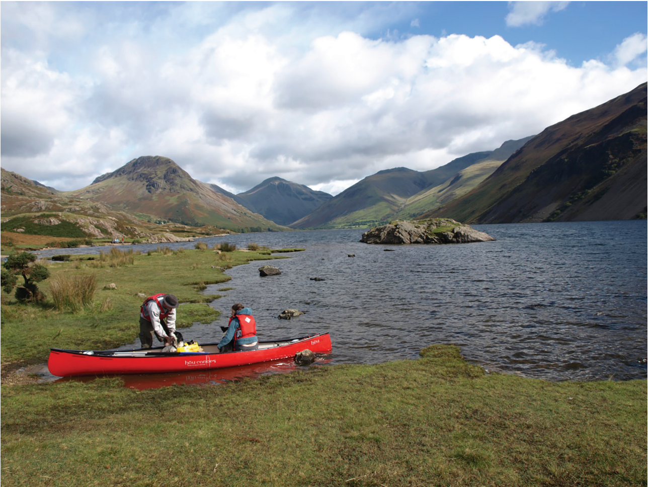
Fig. 6.2 for Question 6