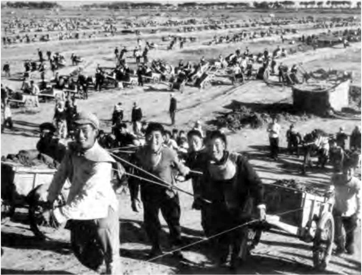
Chinese workers on the Haiho River Project.

15 Study the photograph, and then answer the questions which follow.