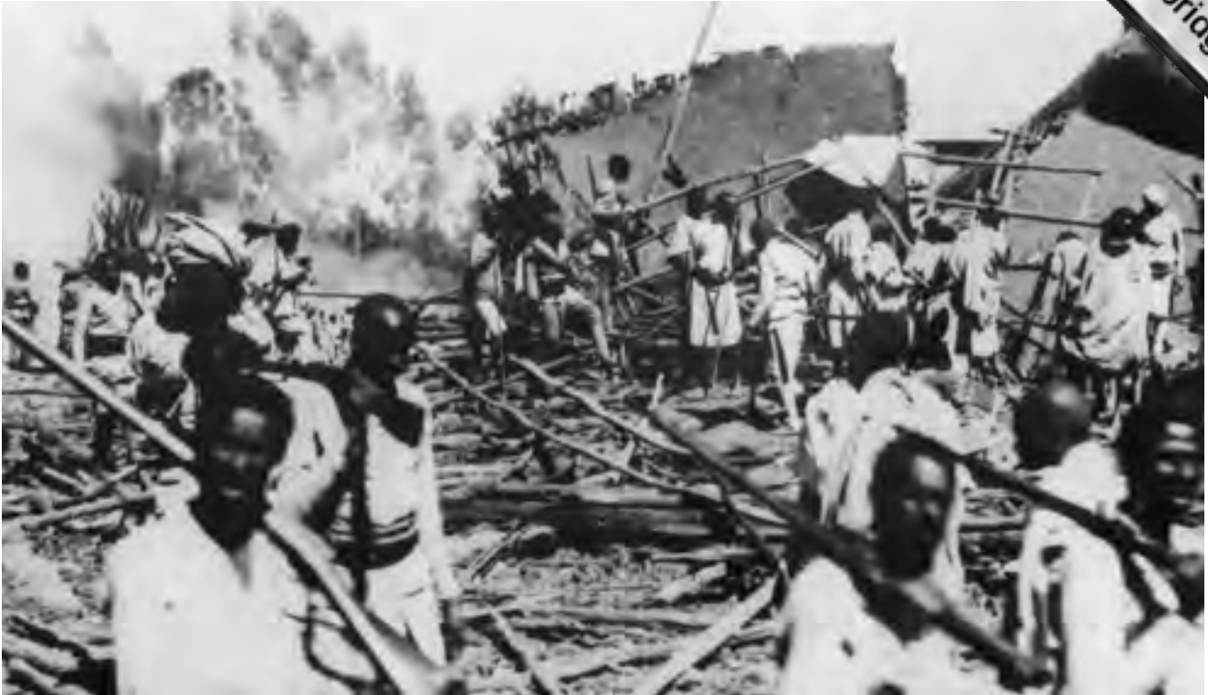
An Abyssinian village bombed by Italian aircraft in the invasion of 1936.

6 Study the photograph, and then answer the questions which follow.