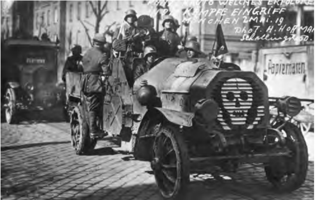
A Freikorps unit in Munich, May 1919.