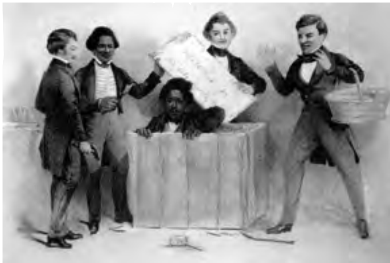
The escape of a slave from Richmond, Virginia to Philadelphia in the North.