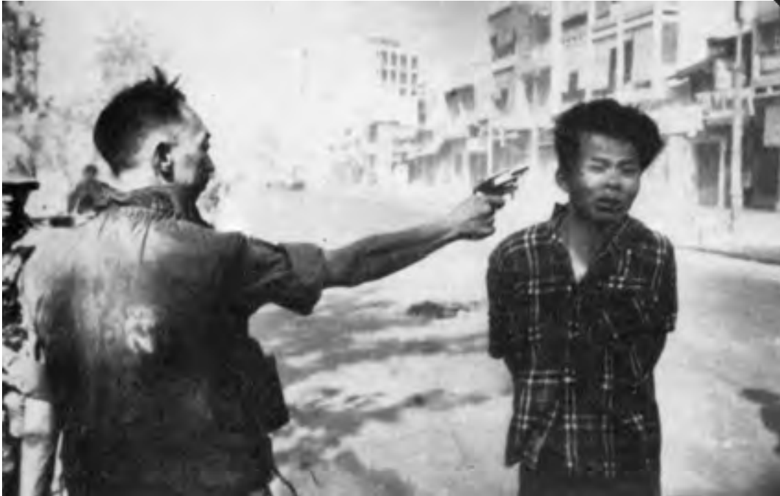
The execution of a Vietcong suspect during the Tet offensive, 1968.