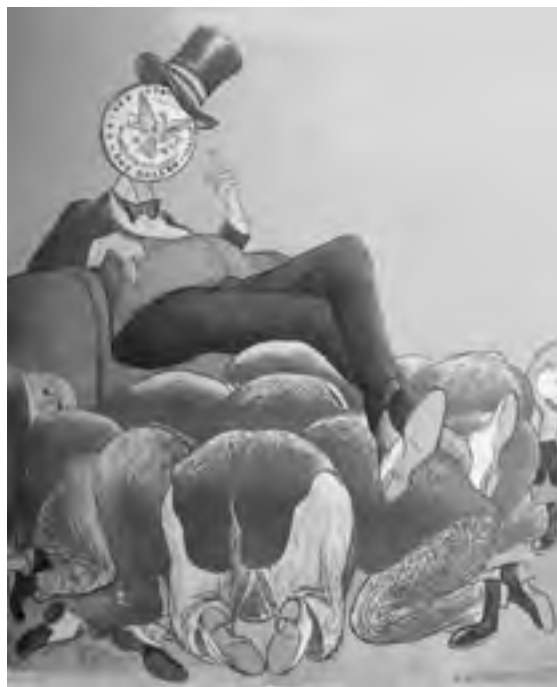
A Soviet cartoon published in 1947. The figures kneeling represent the European countries. They are kneeling in front of the US dollar.