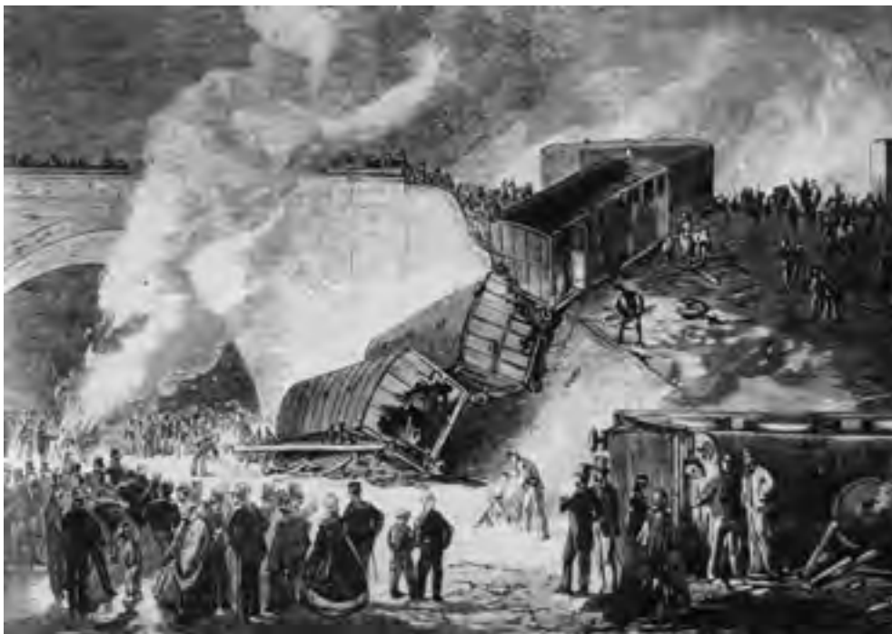
A print of a railway disaster near London in 1861.