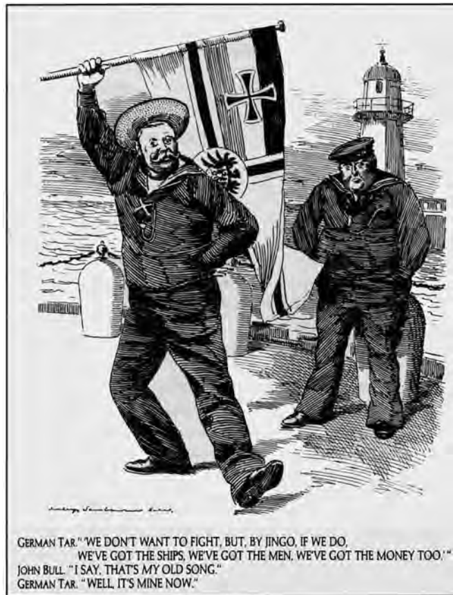
A British cartoon published in March 1909. 'German Tar' is a German sailor. 'John Bull' represents Britain.