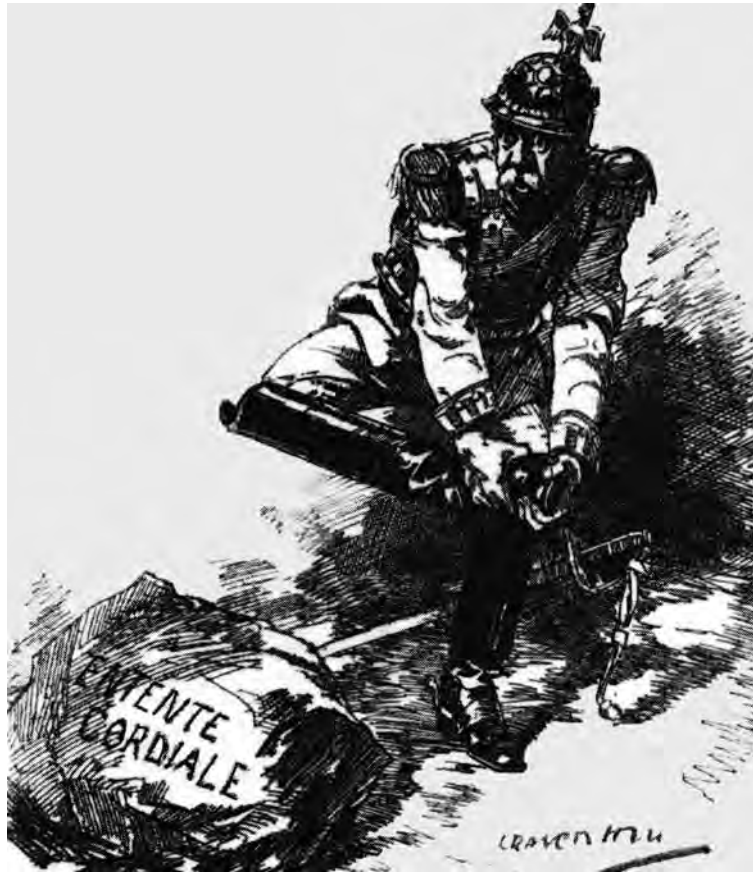
A British cartoon published in August 1911. The figure representing Germany is saying 'It's rock. I thought it was going to be paper.'