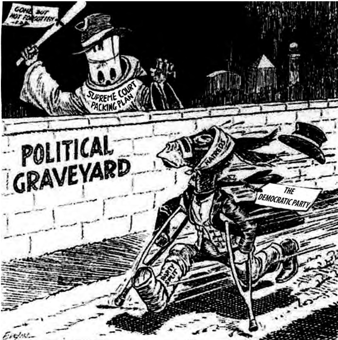
An American newspaper cartoon of 1937.