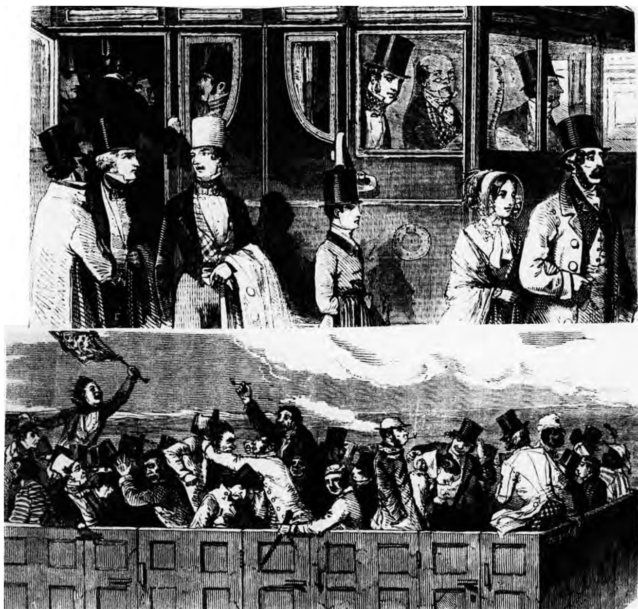
Pictures from the Illustrated London News in May 1847, entitled 'On Their Way To Epsom Races By Train. First and Third Class Carriages'