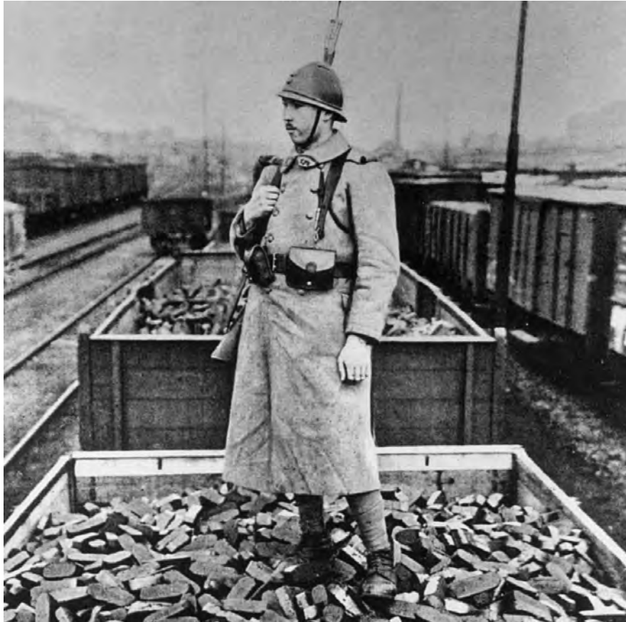
A French soldier guarding a train full of German coal from the Ruhr in 1923.