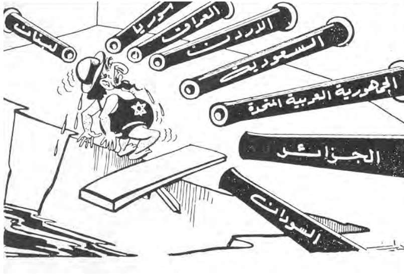
A cartoon published in May 1967 showing Israel facing the armed forces of eight Arab states.

20 Study the cartoon, and then answer the questions which follow.