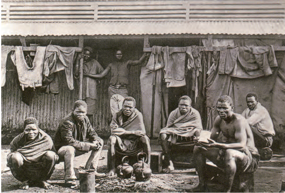
Black mine workers in their compound in the early-twentieth century.

17 Study the photograph, and then answer the questions which follow.