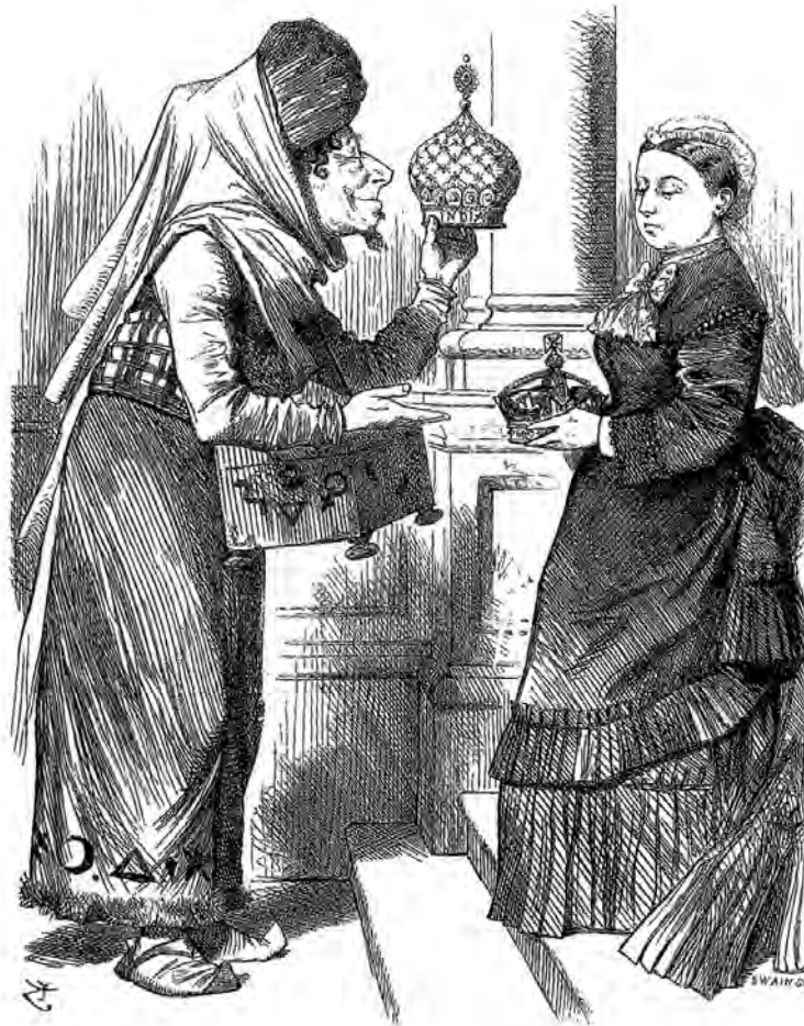
“NEW CROWNS FOR OLD ONES!”

25 Study the cartoon, and then answer the questions which follow.