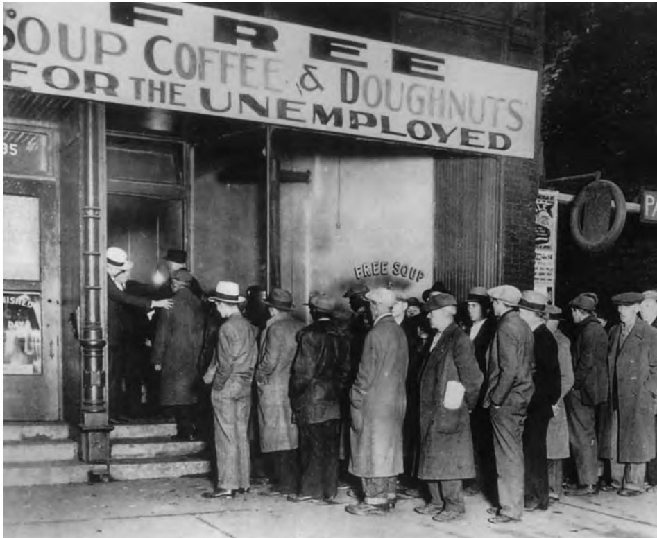
Unemployed people queuing at Al Capone's soup kitchen in Chicago in 1930.

13 Study the photograph, and then answer the questions which follow.