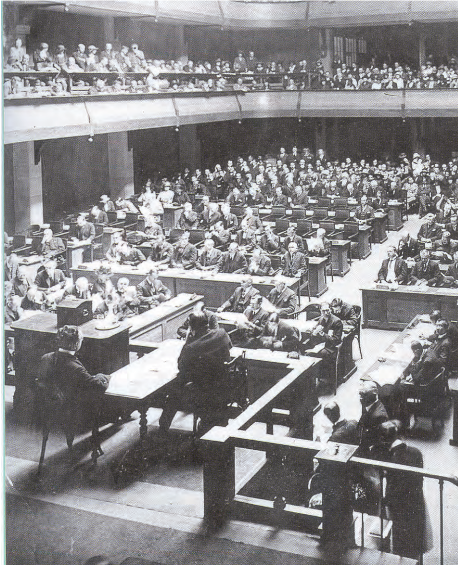
The Assembly of the League of Nations in session, Geneva 1923.