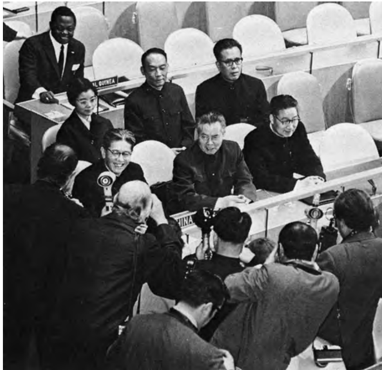
The delegation from the People's Republic of China taking their seats for the first time at the UN, 1971.

15 Study the photograph, and then answer the questions which follow.