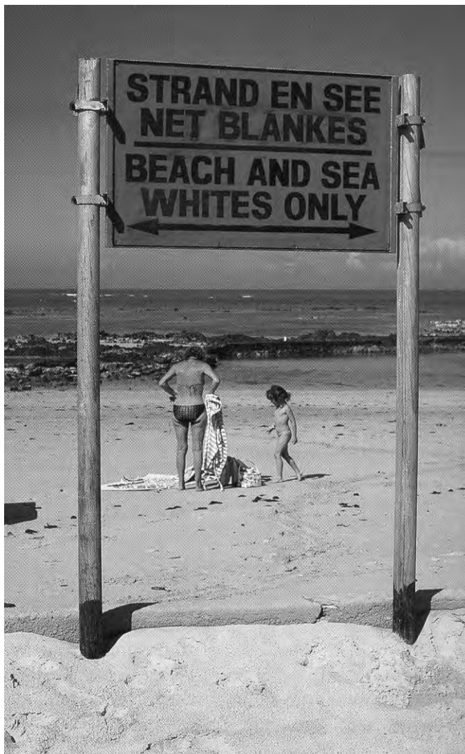
The Separate Amenities Law in action.

18 Study the photograph, and then answer the questions which follow.