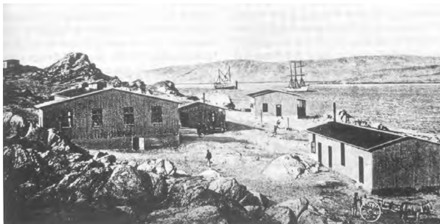
The German trading post at Angra Pequena, Namibia.

19 Study the illustration, and then answer the questions which follow.