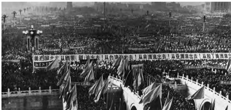
A rally of 700 000 Red Guards in Beijing in 1966.

16 Study the photograph, and then answer the questions which follow.