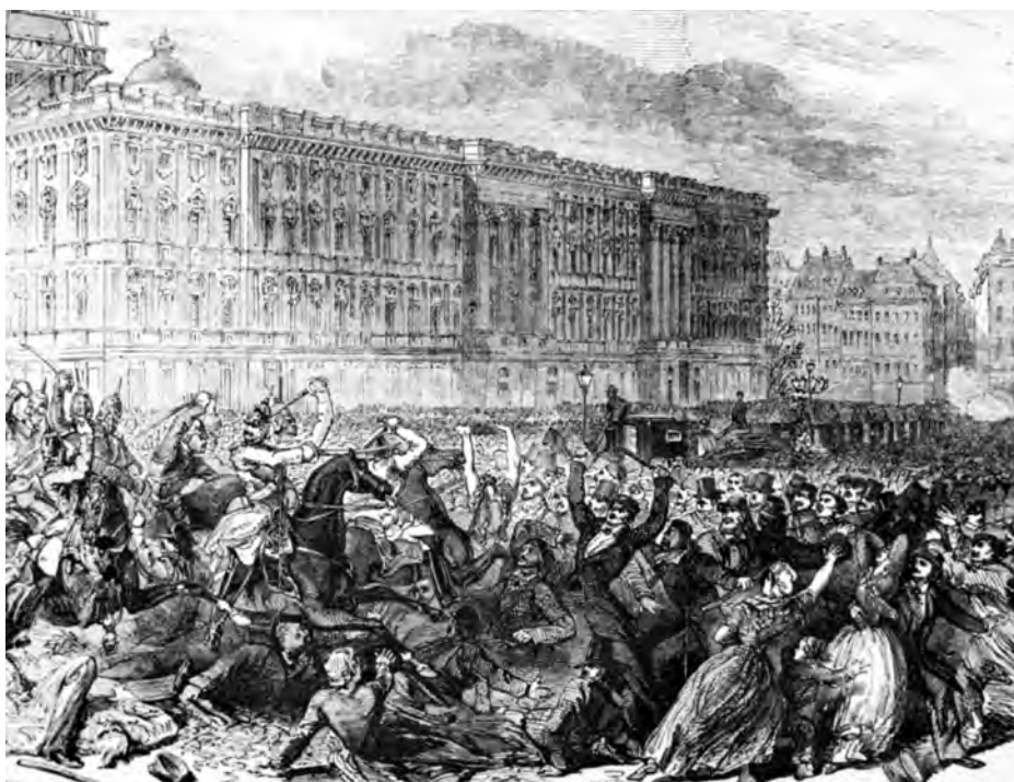
Prussian cavalry charging rioters in front of the Royal Palace, Berlin, 1848.