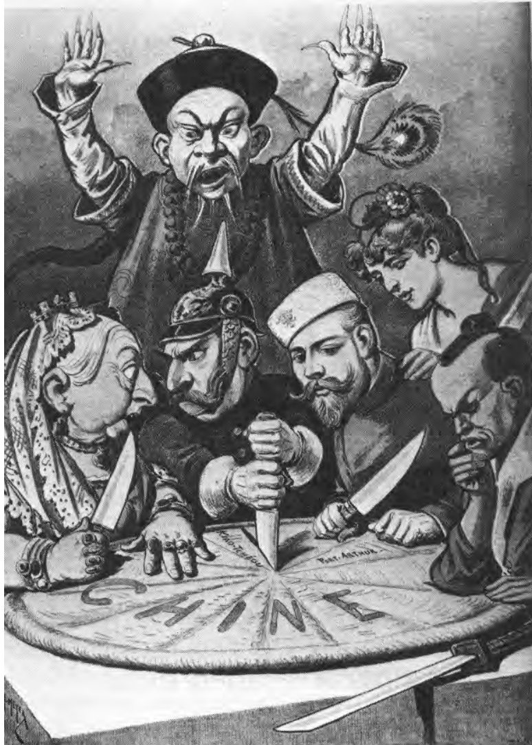
Foreign powers carve up China.

24 Study the cartoon, and then answer the questions which follow.