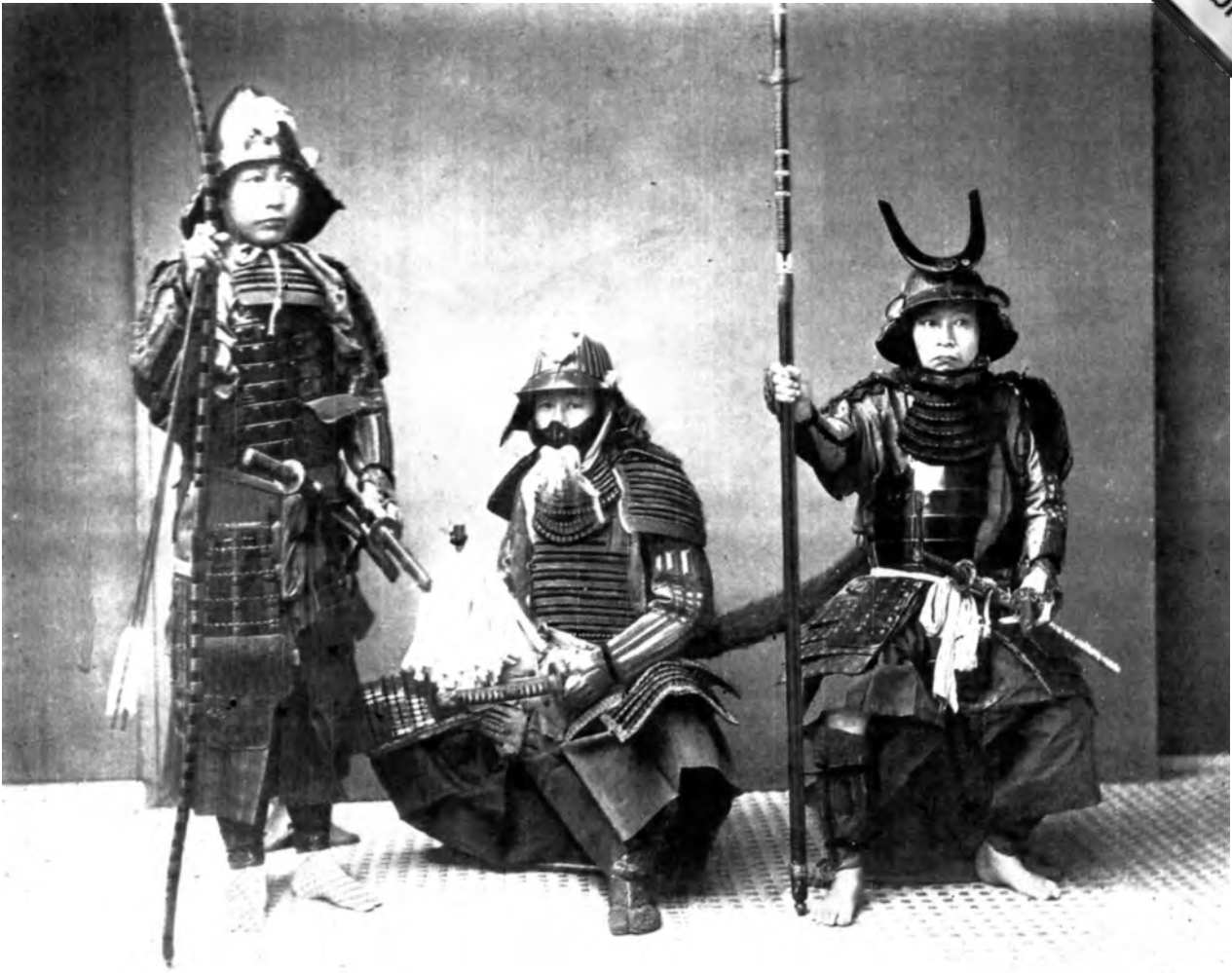
A photograph of Samurai in the 1890s.