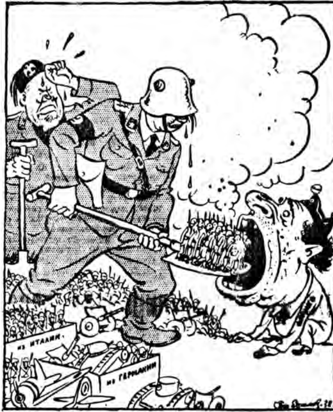
Рис. Бор. Ефимова.