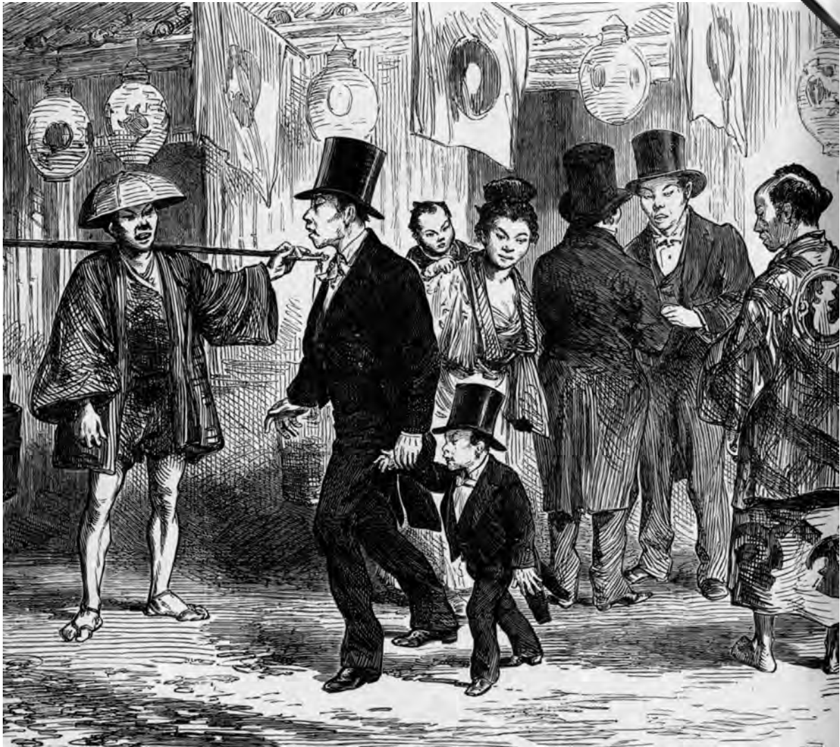
A cartoon of a street scene in Japan towards the end of the nineteenth century. It was published in a British magazine at the time.