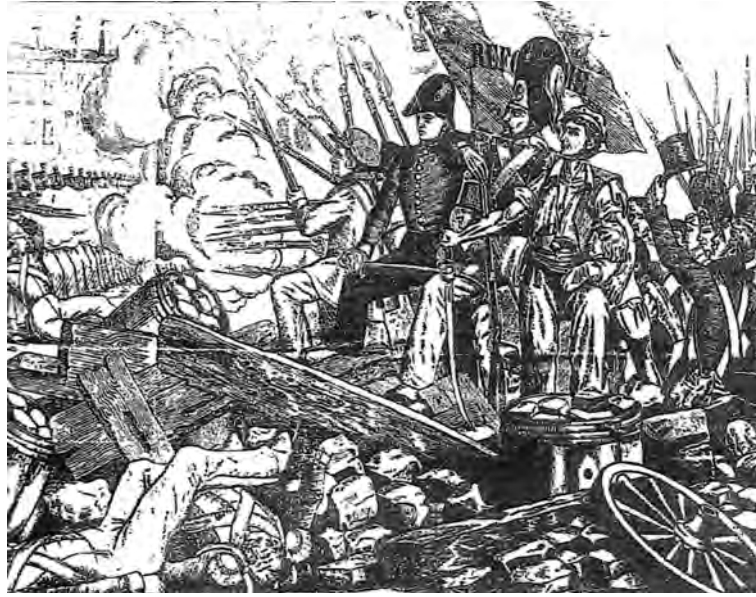
A drawing from the time, of the barricades in Paris in February 1848. On the flag is the word 'REFORM'.