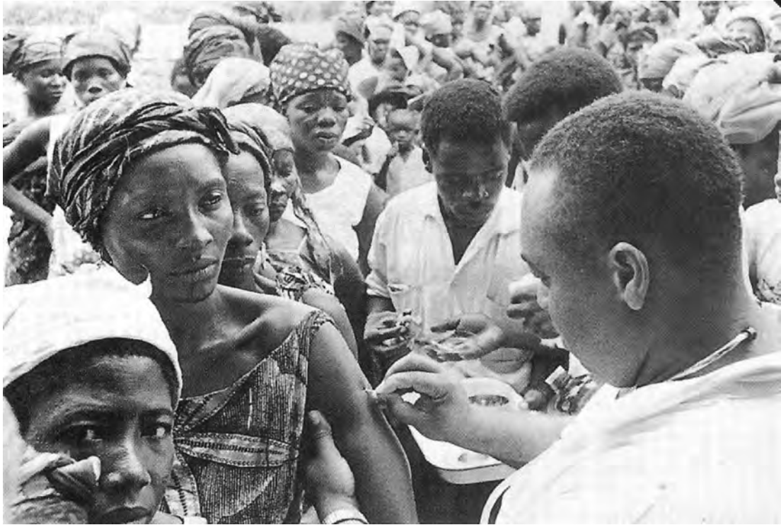
A doctor working for the WHO vaccinating villagers in the Congo to protect them against a smallpox epidemic.