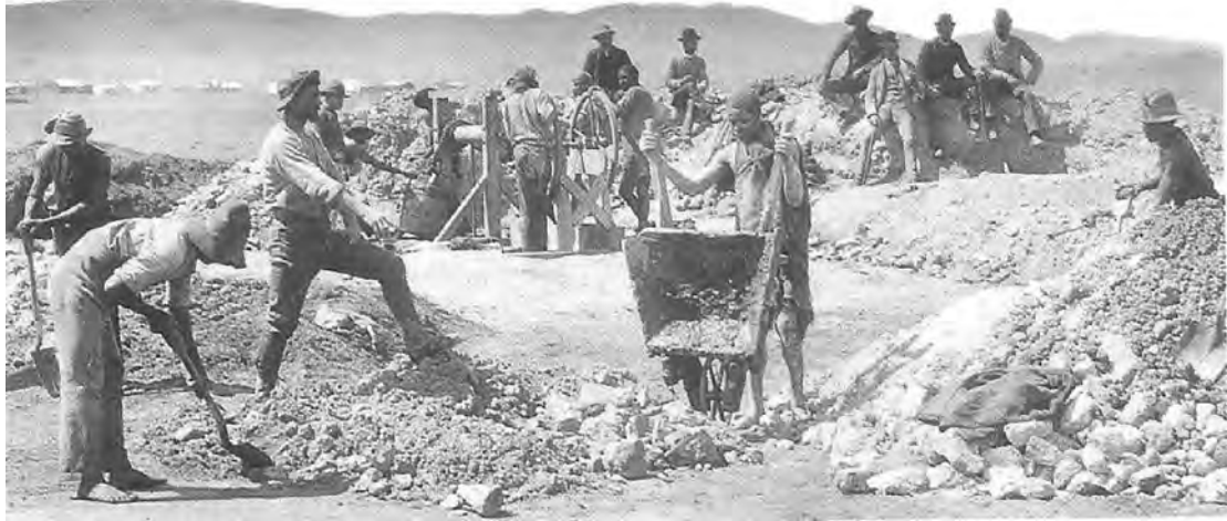
Gold mining at 'the Rand', 1888.

17 Study the photograph, and then answer the questions which follow.