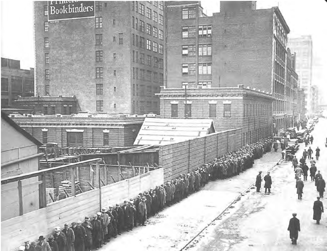
Queuing for a meal in New York, 25 December 1931.

14 Study the photograph, and then answer the questions which follow.