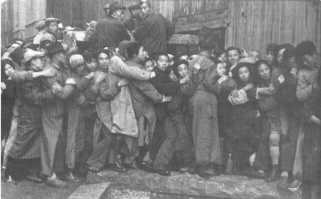
Desperate savers outside a Shanghai bank in 1948, queuing to exchange their paper money for gold before inflation makes it worthless.