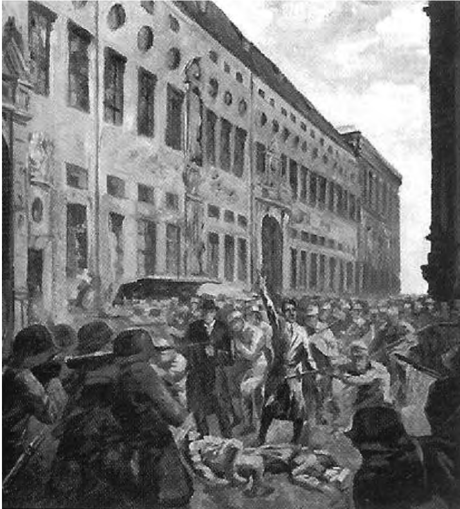
A painting of the Munich Putsch, made by one of the Nazis who took part. Hitler is in the centre and Ludendorff is in the black hat to Hitler's right.