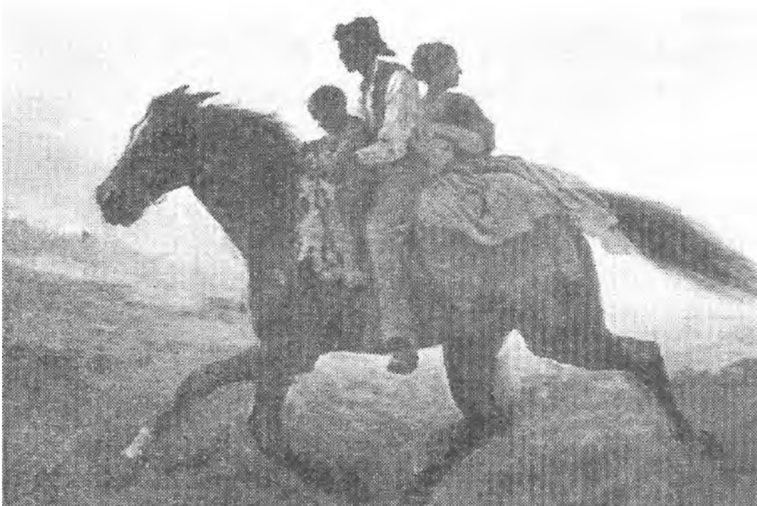
'A Ride for Liberty: The Fugitive Slaves.' An American painting, 1860.