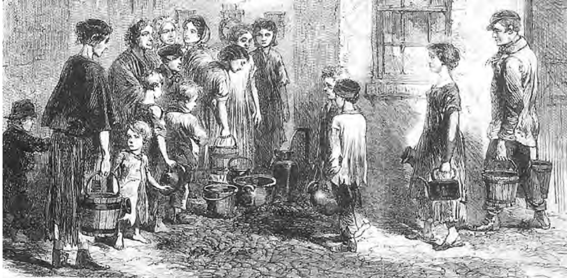
An engraving from 1862 showing a queue for water.

22 Study the illustration, and answer the questions which follow.