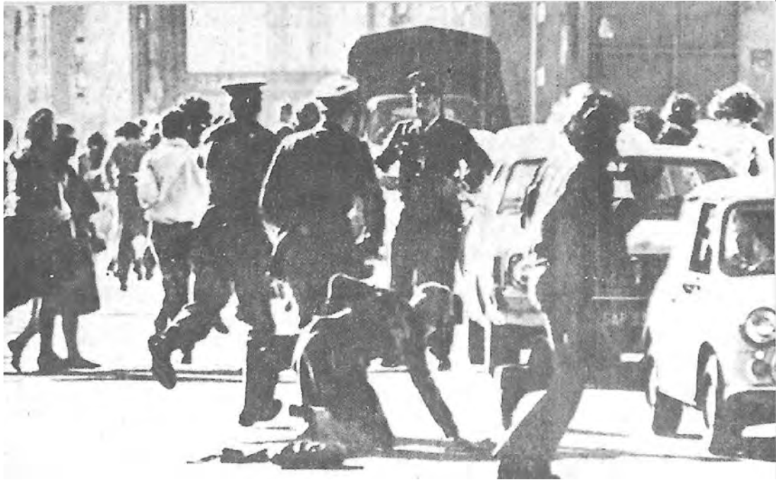
A photograph from the Cape Times, 18 June 1976. It shows people demonstrating at the South African Embassy in London.

18 Study the photograph, and then answer the questions which follow.