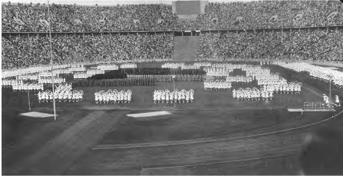
The opening ceremony of the 1936 Olympic Games in Berlin.

10 Study the photograph, and then answer the questions which follows.