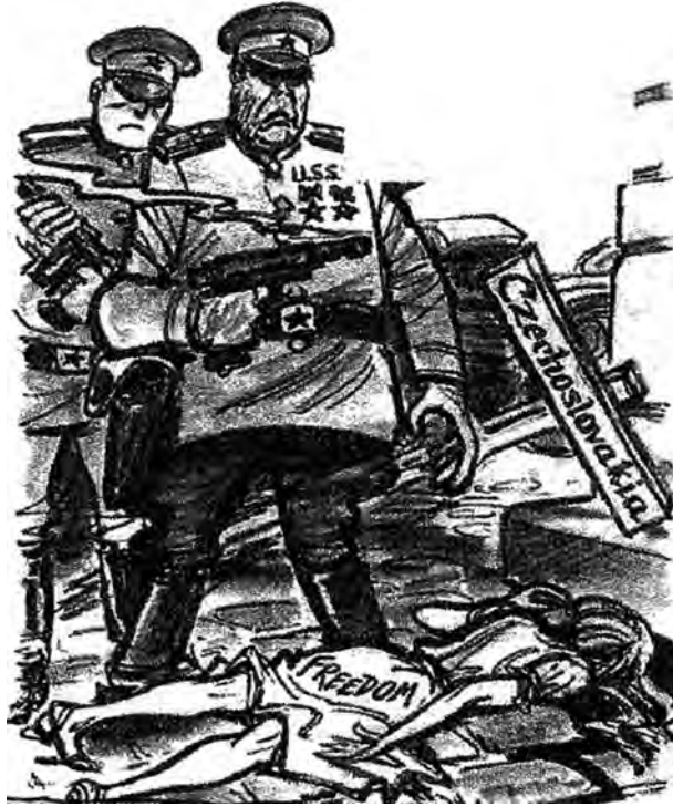
A cartoon published in the USA in September 1968. The soldier is saying 'She might have invaded Russia'.