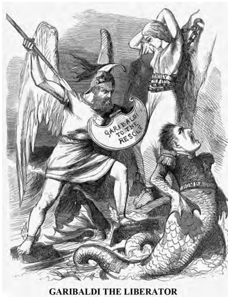
GARIBALDI THE LIBERATOR

A British cartoon published on 16 June 1860. The sea monster represents the Bourbon monarchy.