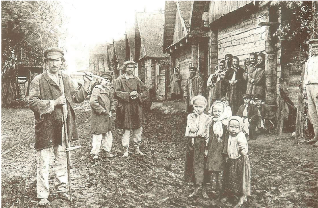
A photograph of a Russian village street around the beginning of the twentieth century.

11 Look at the photograph, and then answer the questions which follow.