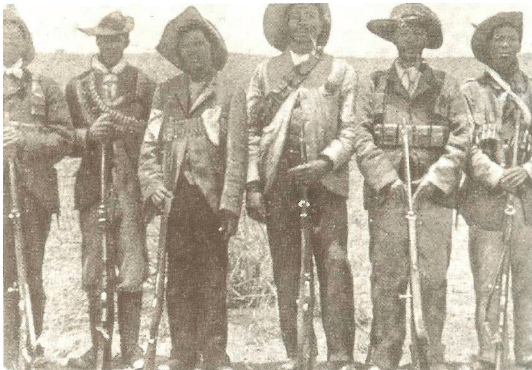
A photograph of Marenga and his guerrilla fighters in 1904.

19 Look at the photograph, and then answer the questions which follow.