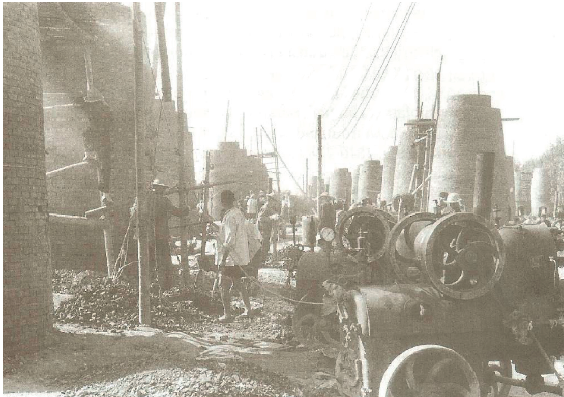
A photograph of 'Backyard Furnaces' in use during the Great Leap Forward.

15 Look at the photograph, and then answer the questions which follow.