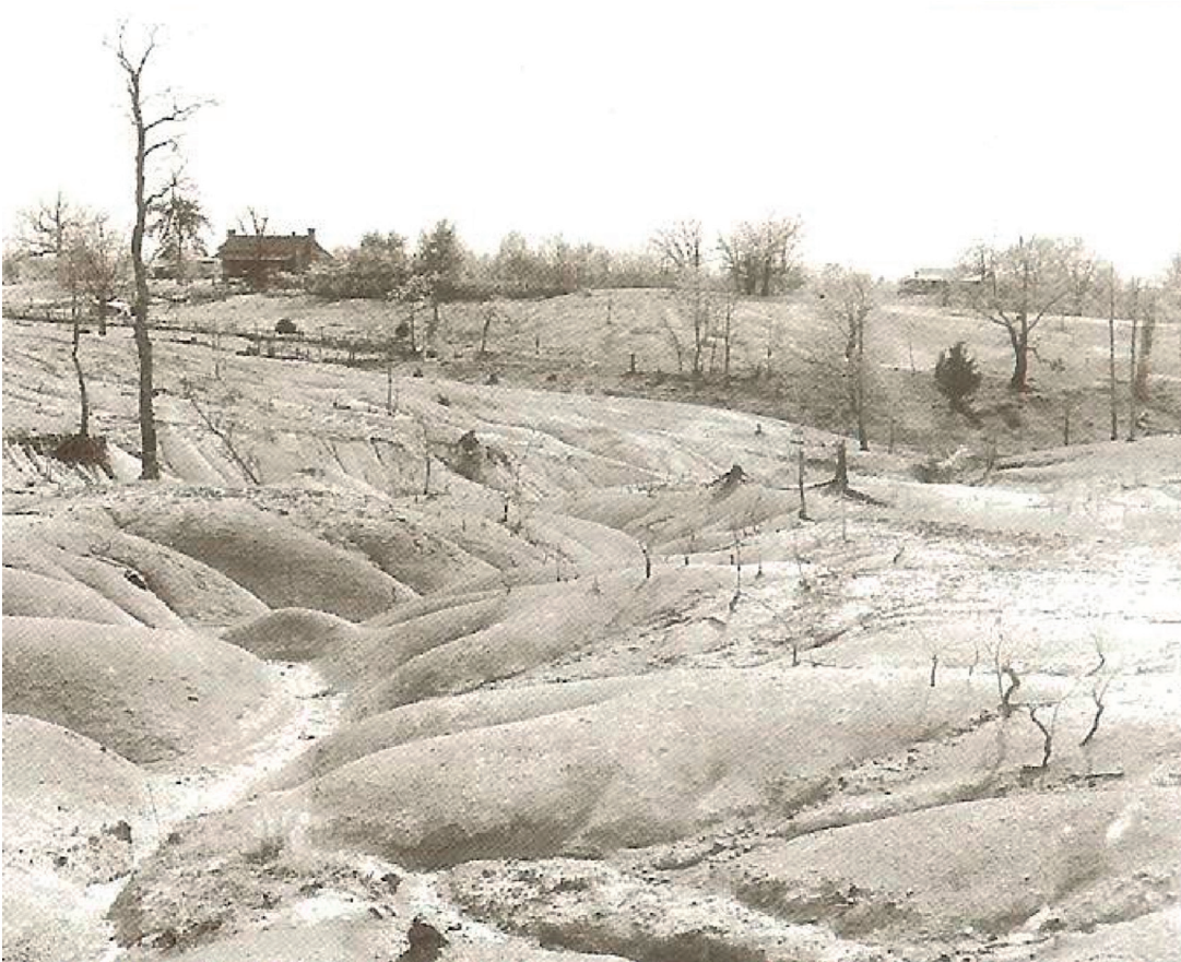
A photograph showing the effects of erosion in the Tennessee Valley.

14 Look at the photograph, and then answer the questions which follow.