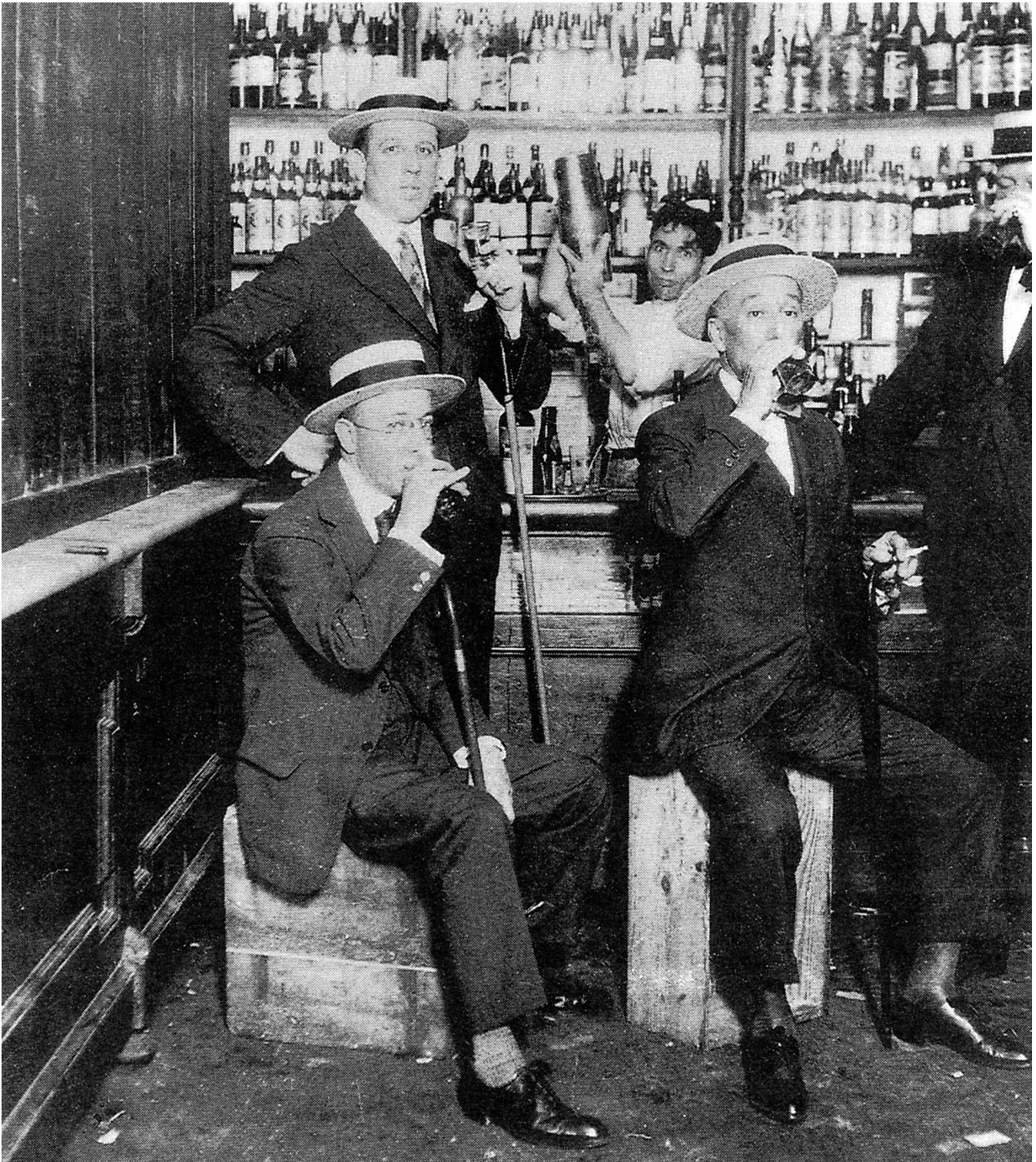
A photograph of a speakeasy.

13 Look at the photograph, and then answer the questions which follow.