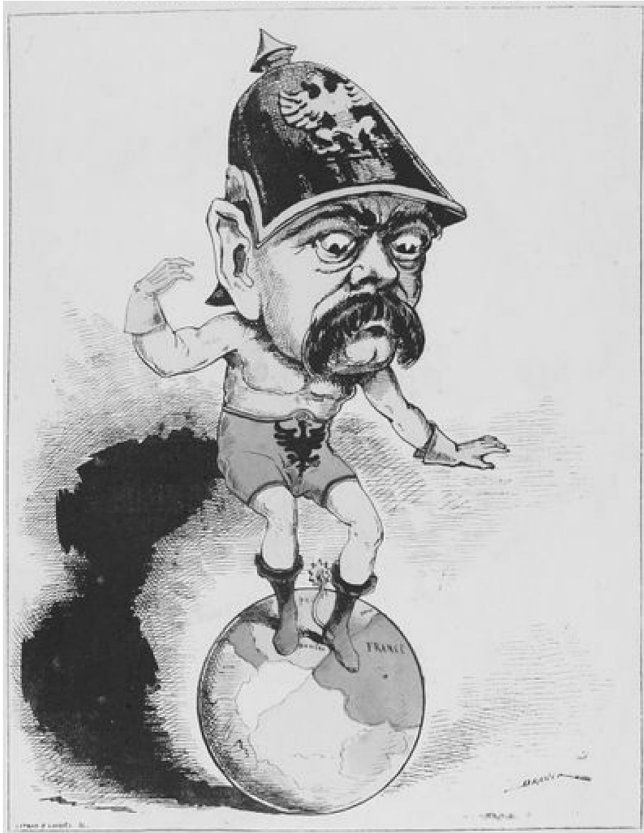
A cartoon published in France, 1870. The title of the cartoon is 'The Man on the Ball'. Bismarck's left foot is on France.