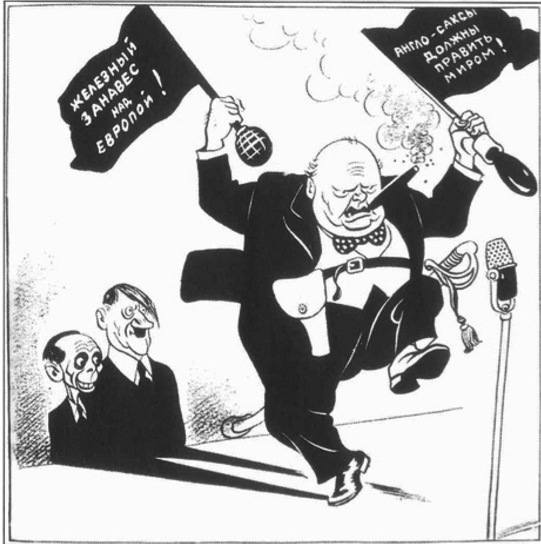
A cartoon entitled 'Churchill and His Predecessors' published in a Soviet magazine, March 1946. The flags read 'Iron Curtain Over Europe' and 'The English Should Rule the World.'