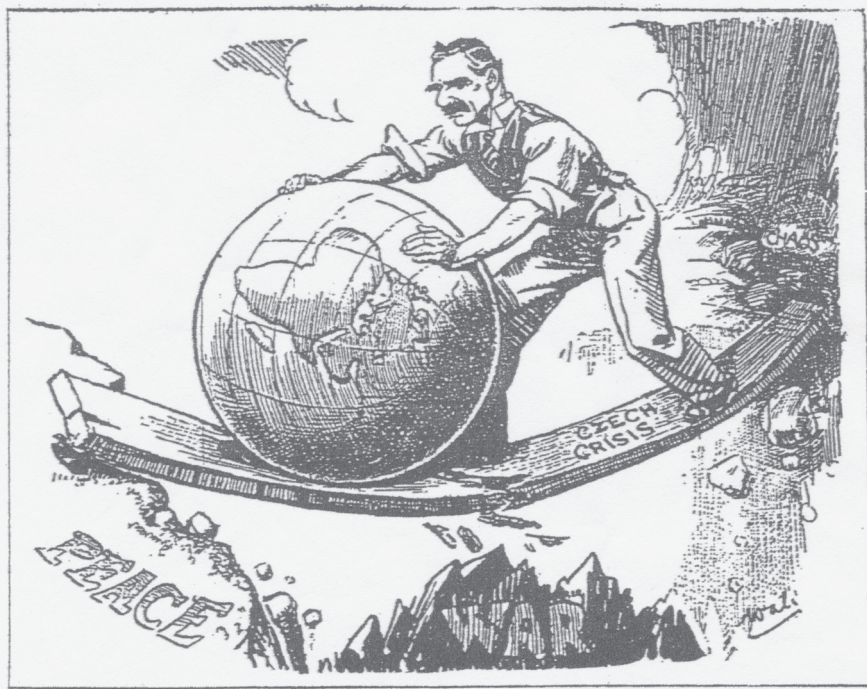
A British cartoon published on 25 September 1938.