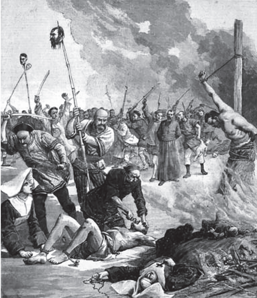
A European drawing from the time showing what happened to some Christians during the Boxer Rebellion.