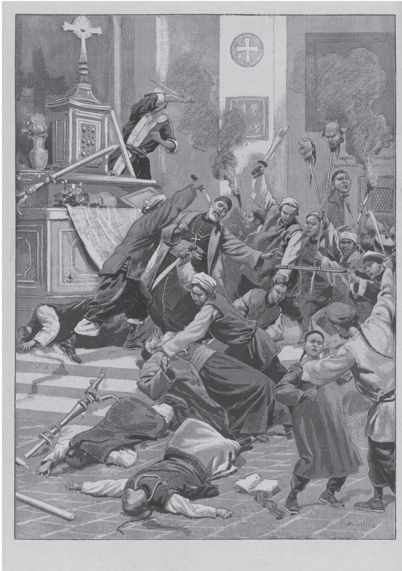
From a French newspaper, August 1900. It shows Boxer rebels in a Christian church.