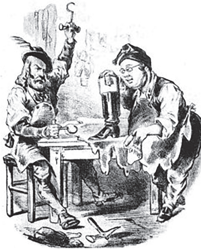
A cartoon from 1861 showing Cavour and Garibaldi making 'the boot' of Italy.