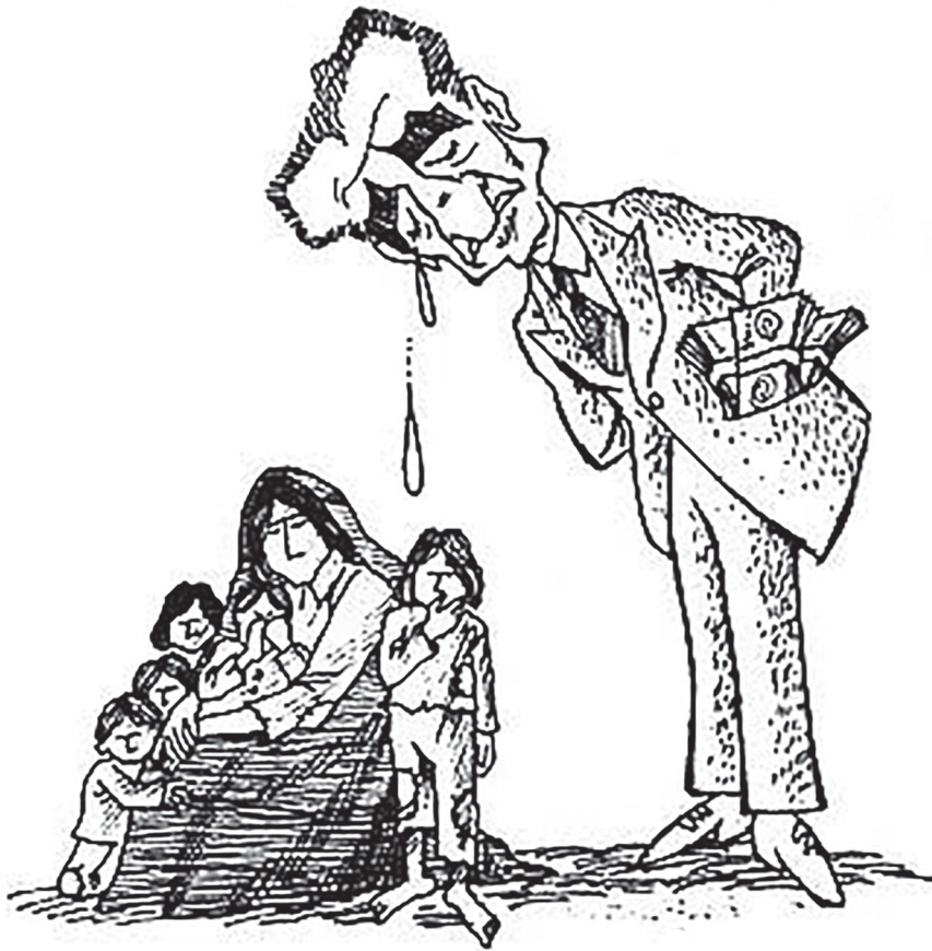
A cartoon published in Iran, 1979. The caption said, 'The Shah had a lot of sympathy for the poor.'