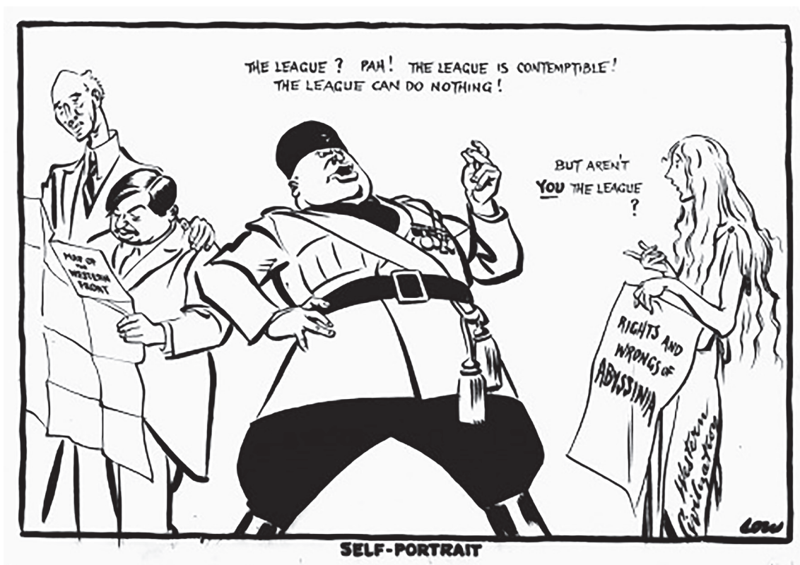
A cartoon published in Britain in February 1935. The figures on the left represent Britain and France.