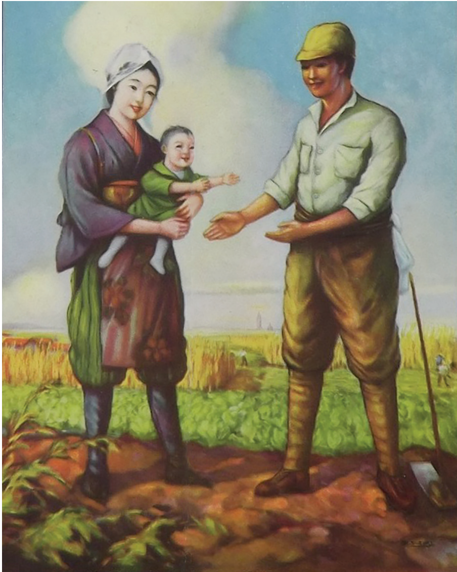
A poster published by the Japanese government in 1936 to celebrate the fifth anniversary of the Mukden Incident. It shows Japanese settlers in Manchukuo.