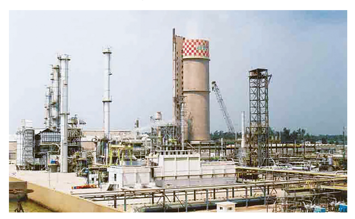
Fig. 4.2 for Question 4

The boundaries and names shown, the designations used and the presentation of material on any maps contained in this question paper/insert do not imply official endorsement or acceptance by Cambridge Assessment International Education concerning the legal status of any country, territory, or area or any of its authorities, or of the delimitation of its frontiers or boundaries.