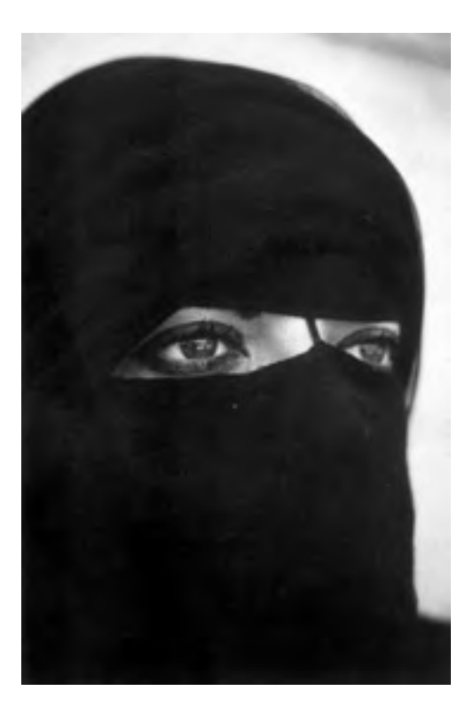
Men and women pray separately in Islam