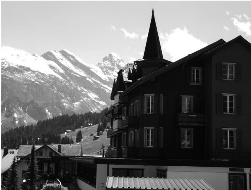
Fig. 3 for Question 2

This hotel in Mürren has 29 rooms and 3 apartments and accommodates up to 60 people. The hotel is non-smoking and pets are welcome. There is a restaurant, a hotel bar and a large sun deck where entertainments (après-ski) are offered in winter. Hotel guests are offered a breakfast buffet and a set evening meal in the restaurant.