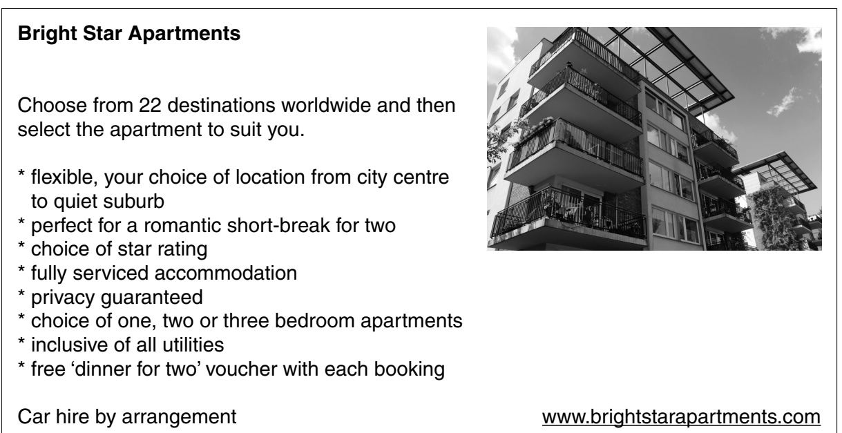
Fig. 4 for Question 4