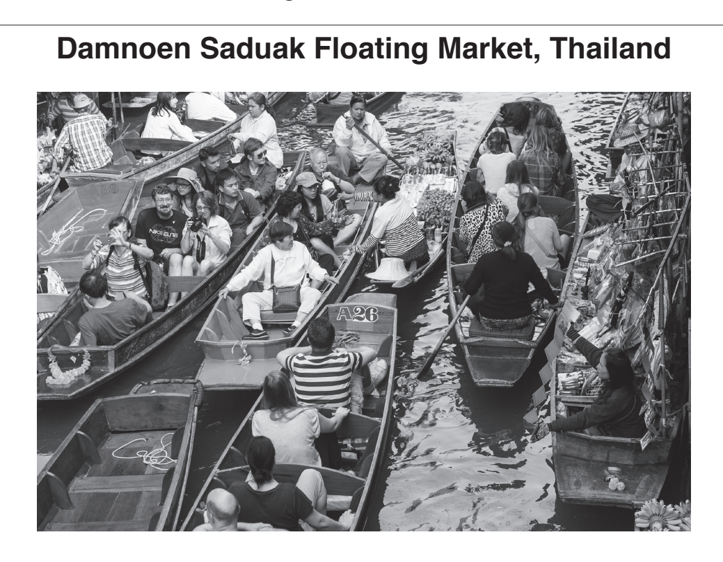
Fig. 3 for Question 4