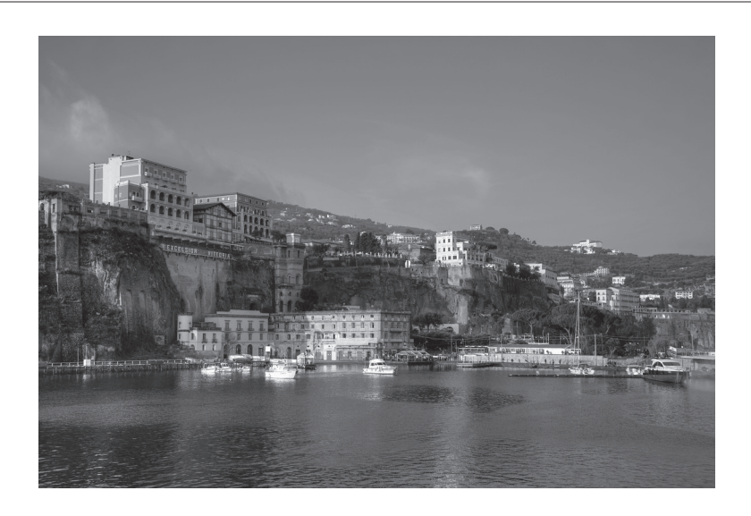
Fig. 1 for Question 1