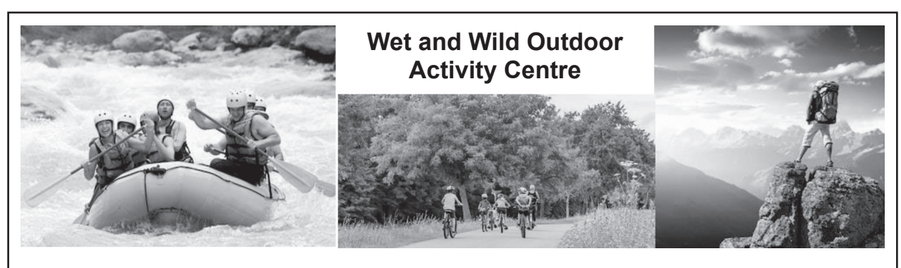
We specialise in educational groups, friends, families and singles

The forest, rivers and surrounding landscape of Wet and Wild Outdoor Activity Centre and Hotel are a playground for adventure seekers. Whether you are on an outdoor activity educational trip, a group of friends out for adventure or a family looking for a fun family activity holiday then look no further. From wild water rafting and rock climbing to a family bike ride around the countryside all will be provided at the Wet and Wild Outdoor Activity Centre. We arrange your transport, accommodation and insurance, so book your package today.