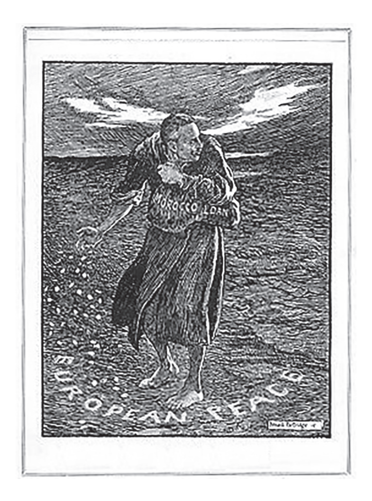
A cartoon published in a British magazine, August 1905. The title of the cartoon is 'The spreader of harmful weeds'. The figure represents the Kaiser.