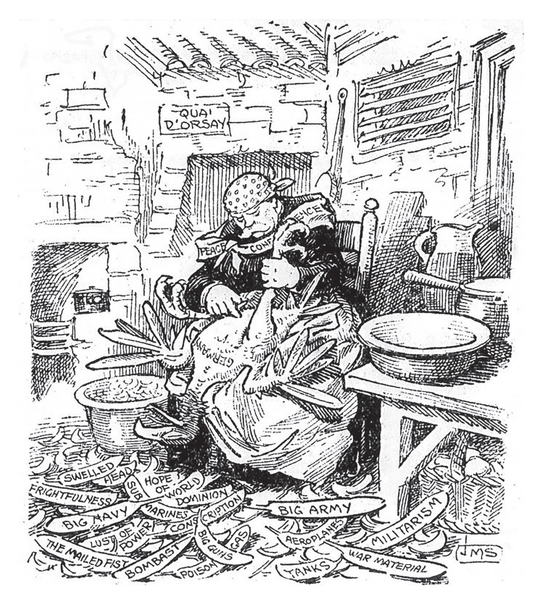
A British cartoon published in March 1919. The Quai d'Orsay was the address of the French Ministry of Foreign Affairs.