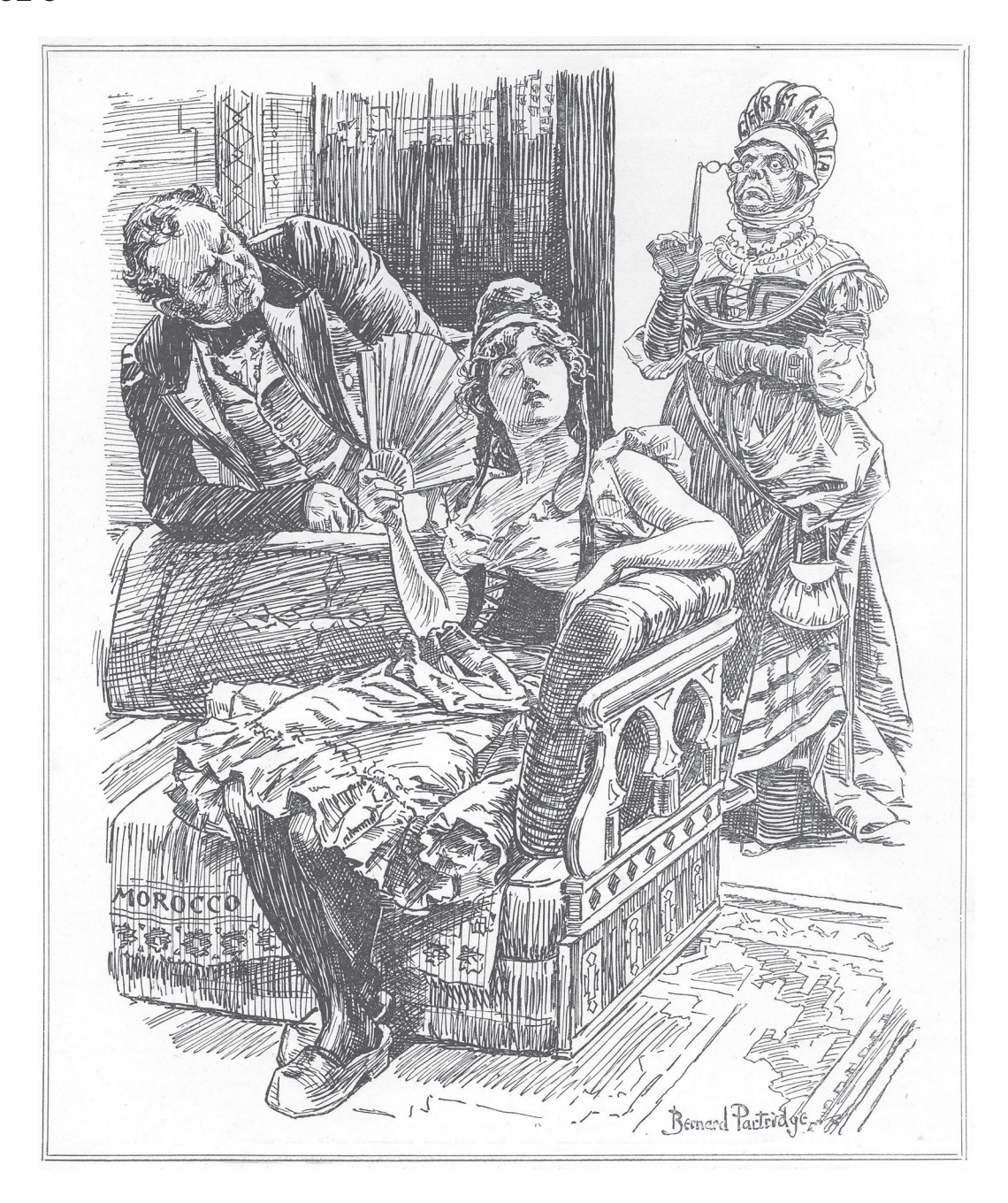
A cartoon published in a British magazine, 12 April 1905. The title of the cartoon is 'The match-maker despite herself'. France is saying to Britain, 'If Germania is going to glare at us like that, it almost looks as if we might have to be properly engaged.'