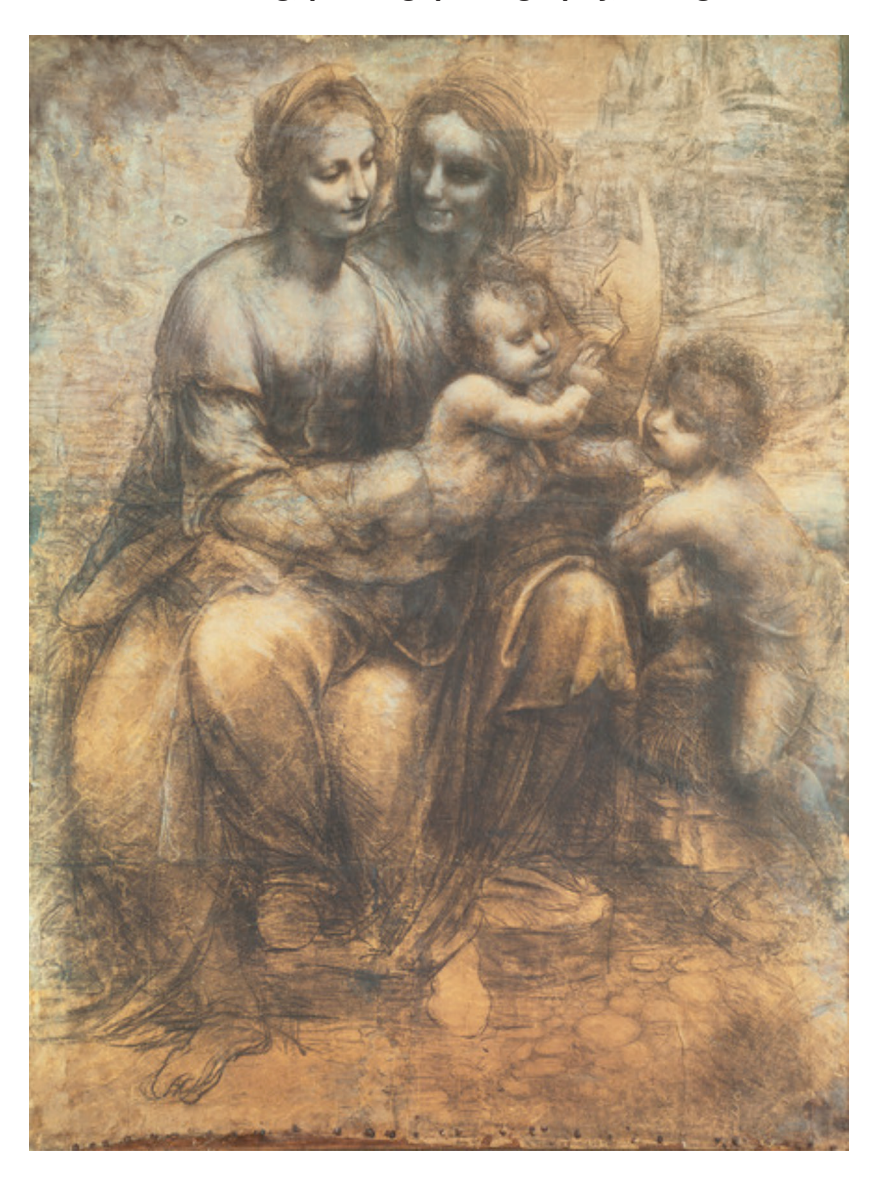
Section 4: Drawing, printing, photography, collage and film

Leonardo da Vinci, Virgin and Child with Saint Anne , c.1499–1500, (charcoal (and possibly wash) heightened with white chalk on paper, mounted on canvas), (141.5 cm × 104.6 cm), (National Gallery, London)