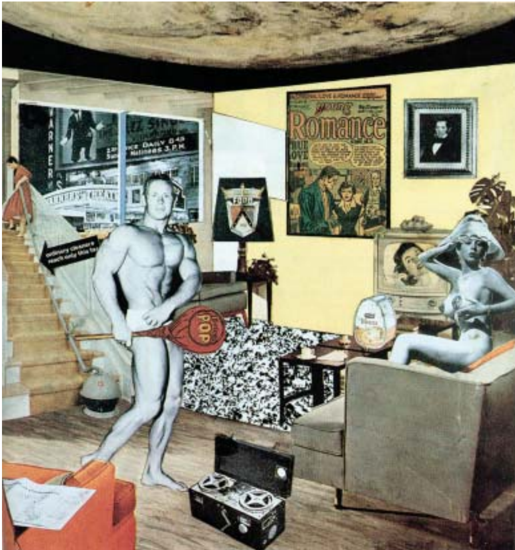
Richard Hamilton, Just what is it that makes today's homes so different, so appealing? 1956

(collage) (26 × 24.8 cm) (Kunsthalle, Tübingen)