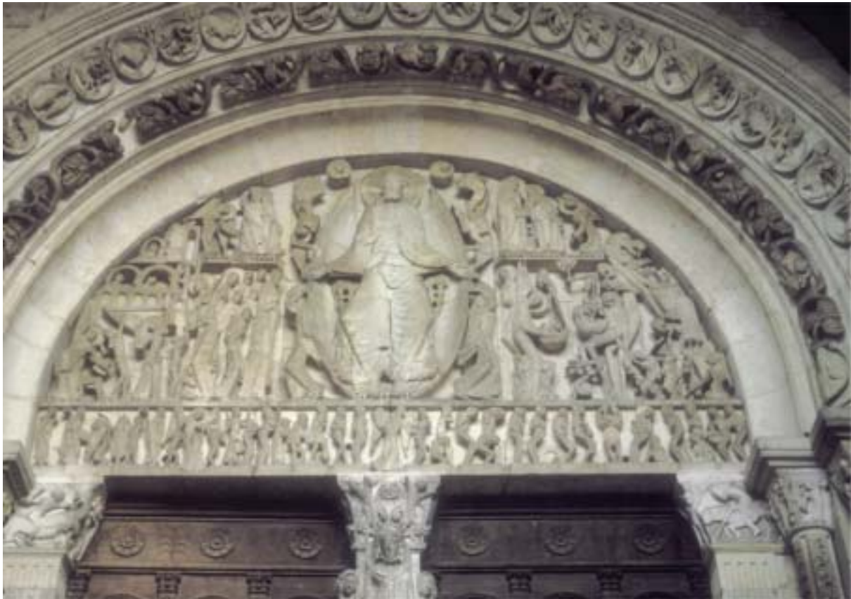
Gislebertus, Tympanum , Autun Cathedral, c.1130–45

(stone) (width 640 cm) (Cathedral of Saint-Lazare, Autun)