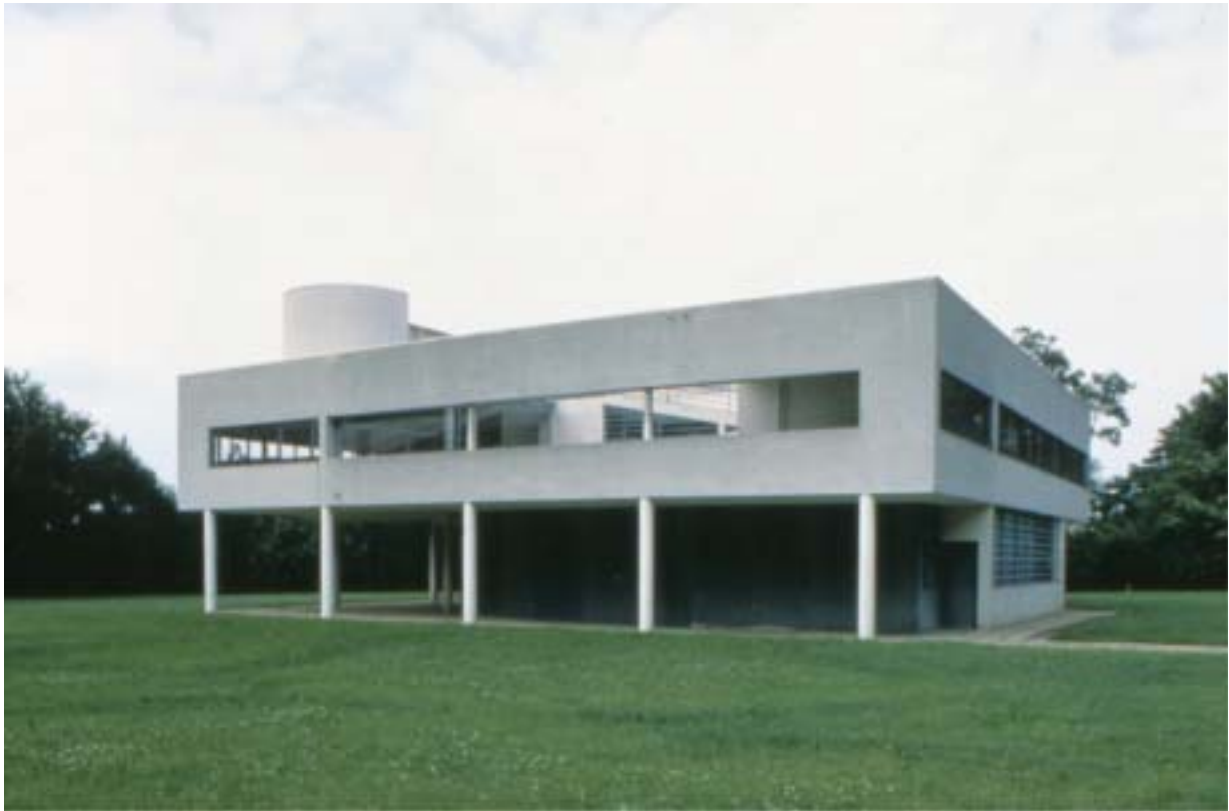
Le Corbusier, Villa Savoye , Poissy-sur-Seine, 1929