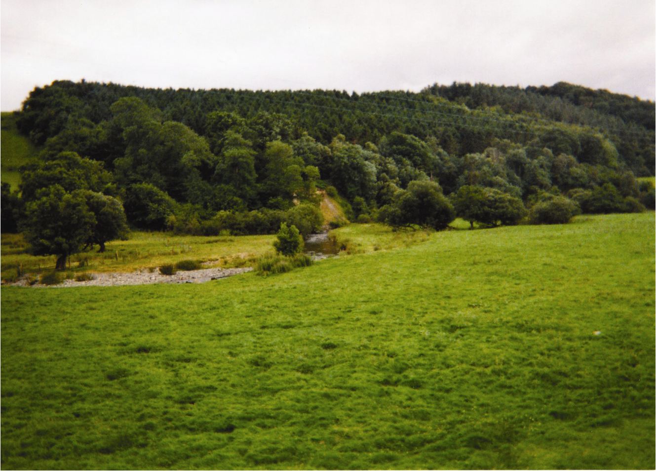
Photograph A for Question 3