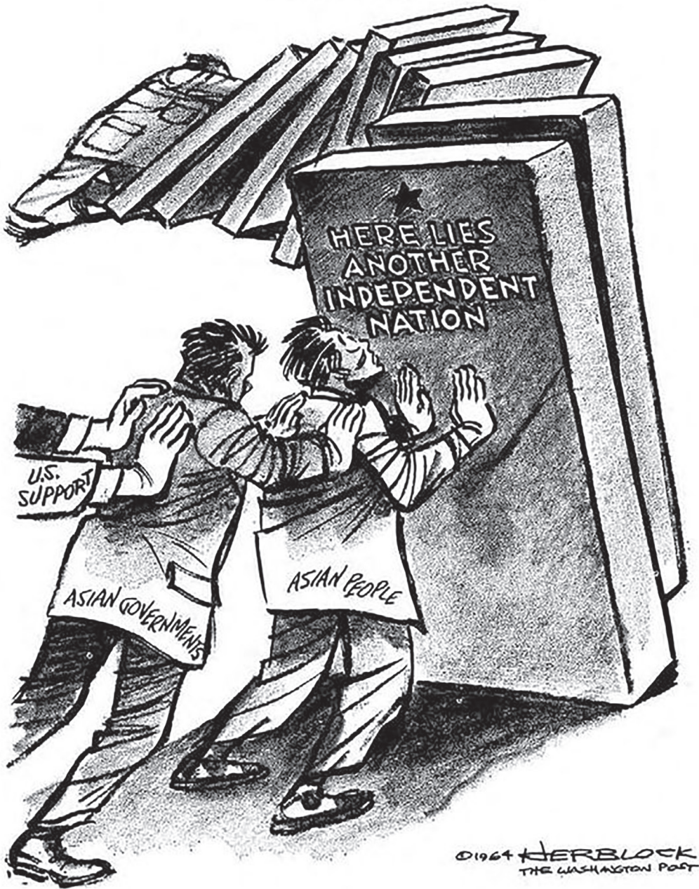
A cartoon published in the United States in May 1964.