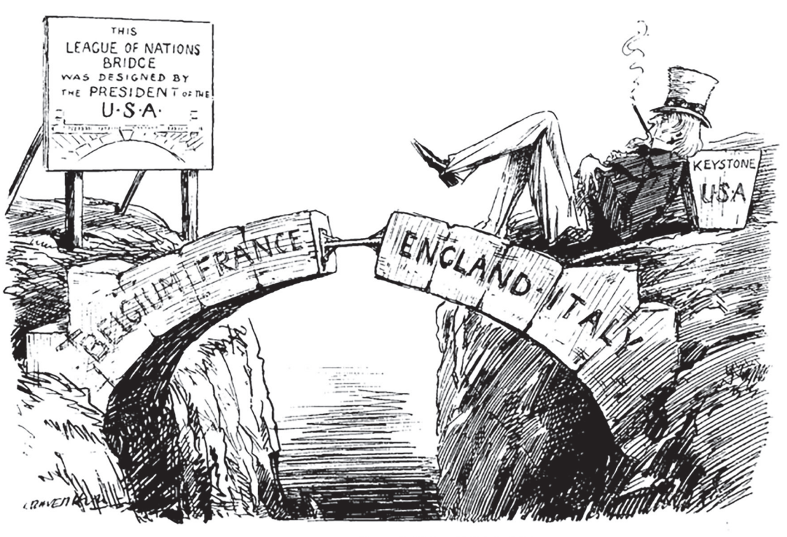
THE GAP IN THE BRIDGE.

A cartoon published in a British magazine, December 1919. The keystone is the stone that locks the structure together.